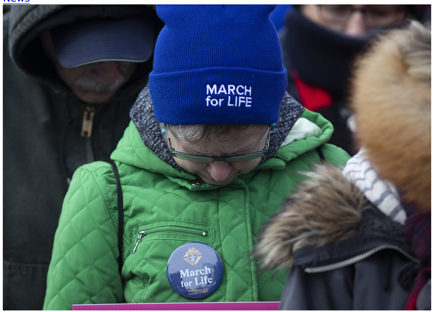
Pro-life advocates pray during the annual March for Life in Washington Jan. 21, 2022.