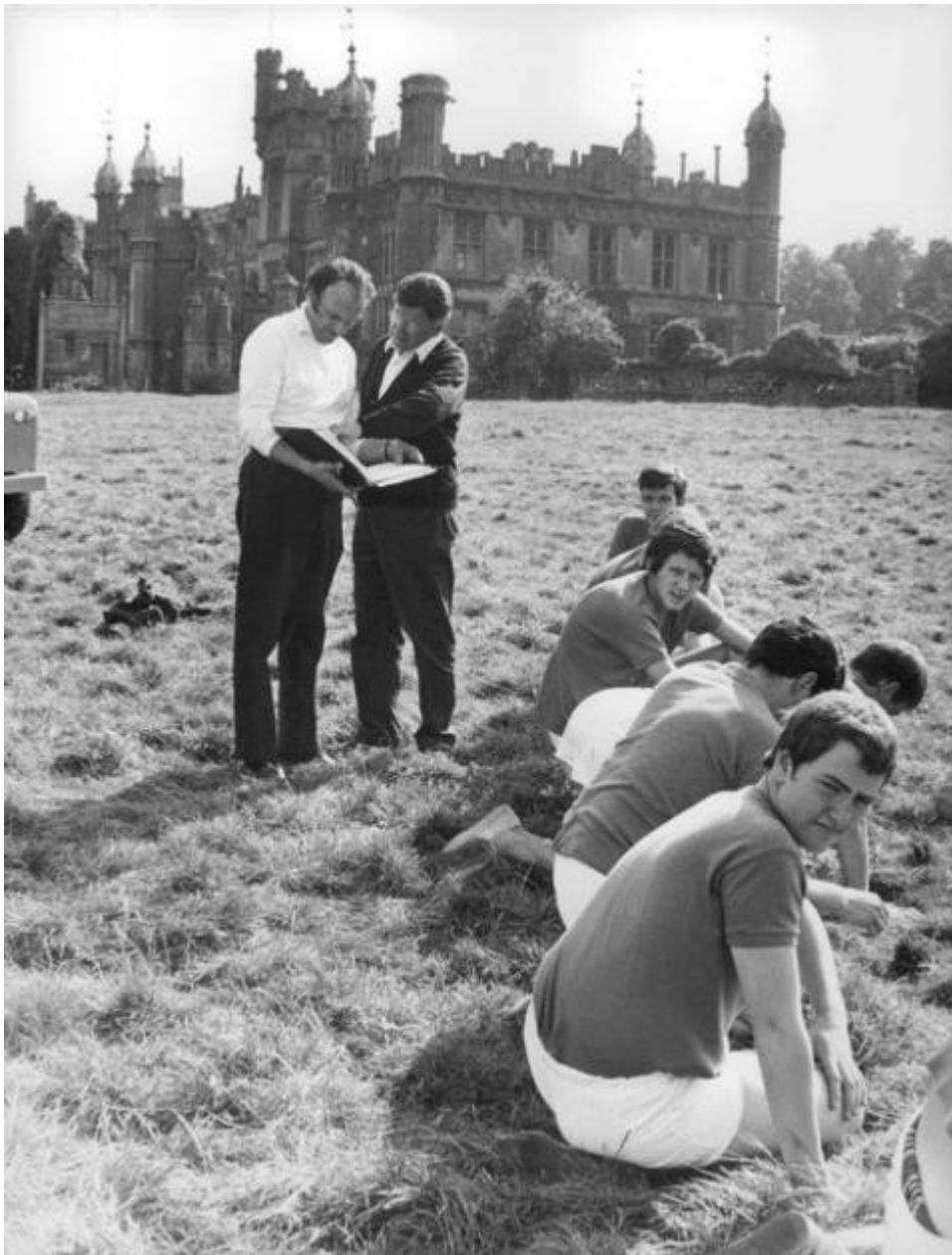
Pictured is a scene from the 1967 British comedy "Decline and Fall of a Birdwatcher" an adaption of Evelyn Waugh's first novel, "Decline and Fall," published in 1928.

cuts away at everything that veils sin. In his 1934 novel A Handful of Dust , that veil is made of fame, privilege, power, class and socialite culture. Waugh tears the veil away in a scene that can't be forgotten. A mother who pursues a romantic affair with an awful man called John — who bears the same name as her young son — receives news that "John" had suffered a terrible accident. As it slowly dawns on her that the victim is her little boy and not her lover, her initial reaction is to thank God in relief — before bursting into tears. The horrible scene is compelling because it's so authentically human.