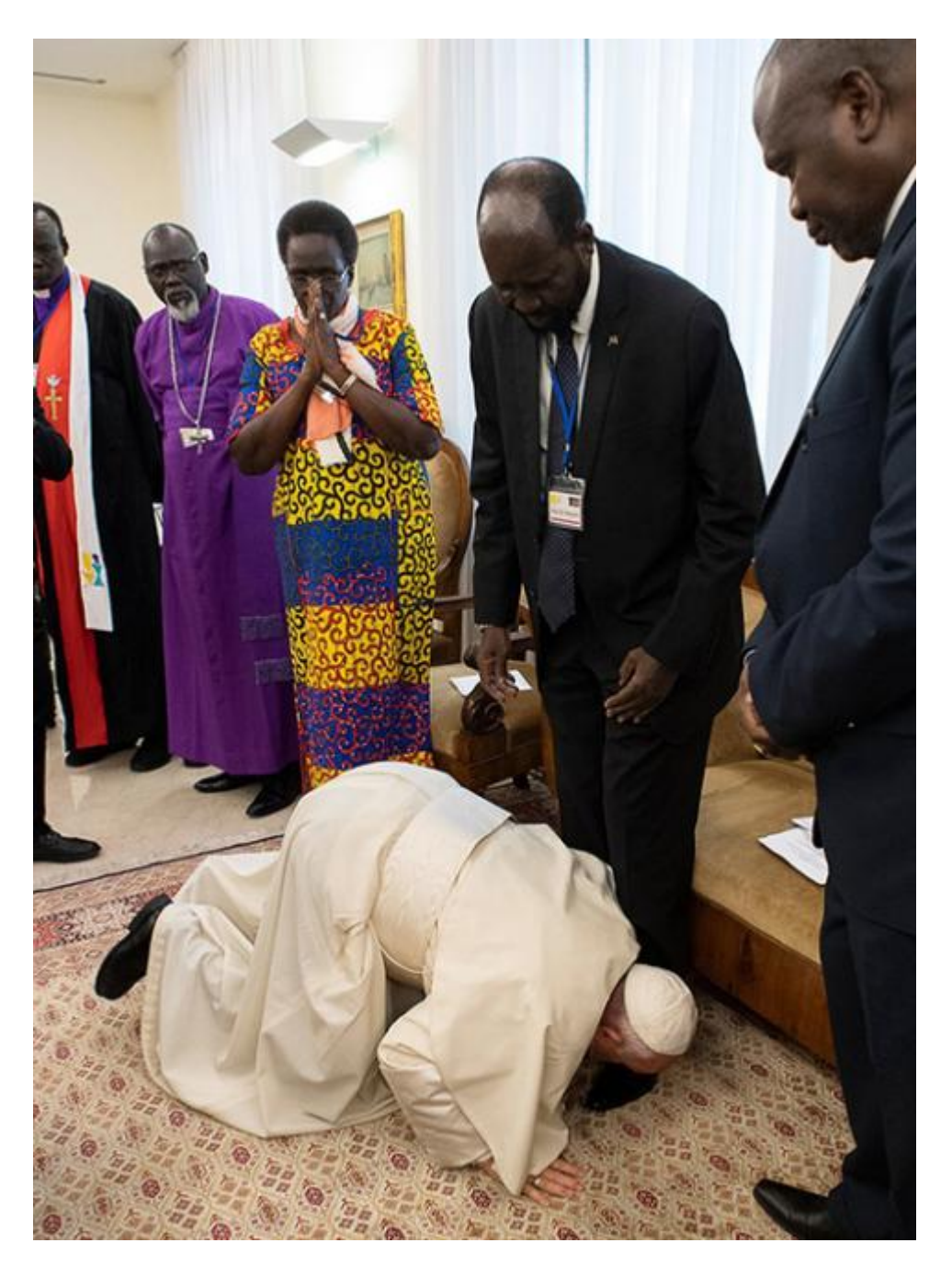
Pope Francis kisses the feet of South Sudan President Salva Kiir at the Vatican April 11, 2019.

Reflecting back on the 2019 spiritual retreat at the Vatican when the pope begged for peace — a moment Kiir later <u>said</u> caused him to tremble — Boyle said the ecumenical visit is a "realization" of that retreat.