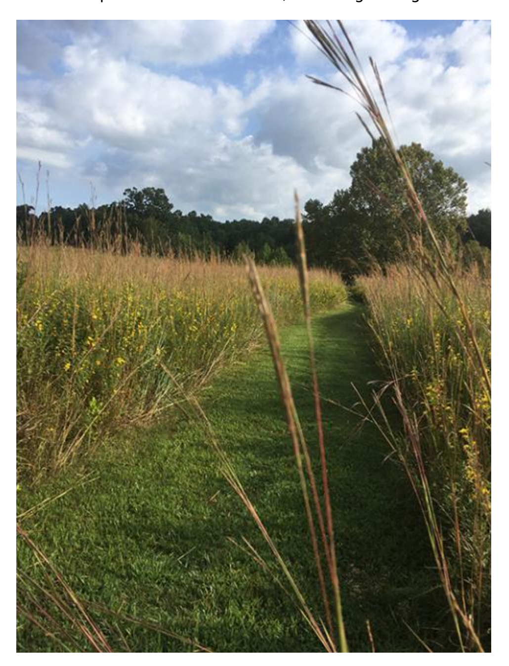
A path through a field at Loretto Motherhouse Farm (Susan Classen)

Conversations about the six-acre cemetery led the sisters to consider a more encompassing preservation approach. A committee was appointed in 2018 to examine options for conservation, including selling off land to establish a state park.