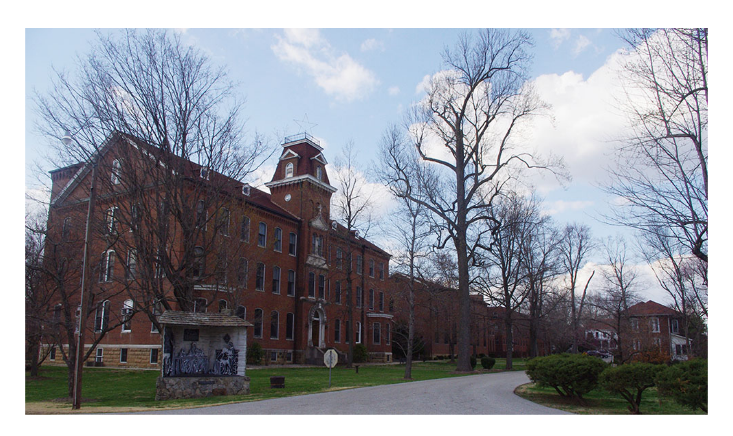
The Loretto Motherhouse in Nerinx, Kentucky

Among the land left out of the easement is the 30-acre motherhouse campus that includes the church, convent and nursing home. Another 75 acres was designated for future needs — whether for the Lorettos or the land's next owners — for instance, housing for migrant farmworkers.