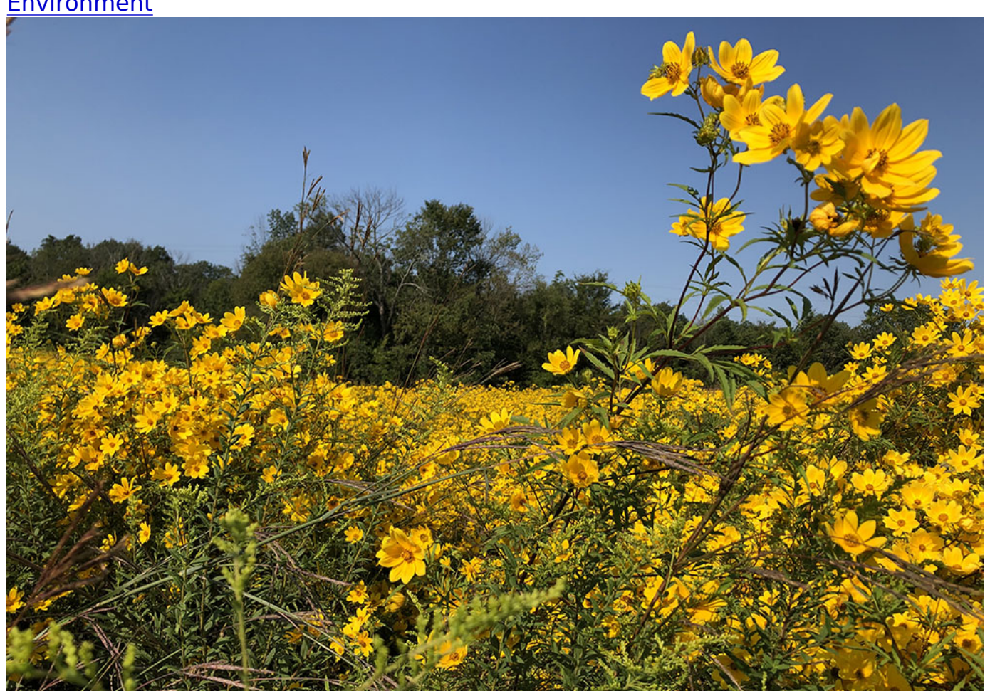
Beggarticks flowers (Bidens frondosa) at Loretto Motherhouse Farm in Kentucky