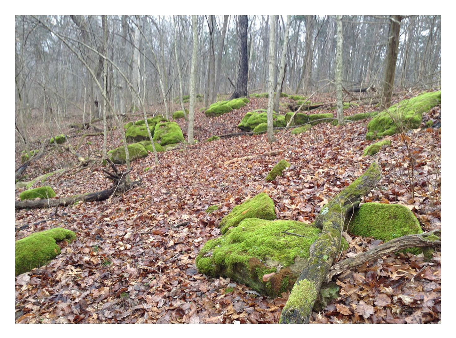
Wooded upland at Loretto Motherhouse Farm

Attention to the future of the sisters' land <u>ramped up in 2013</u>, after fossil fuel companies sought to build the Bluegrass Pipeline across their property, including possible use of eminent domain. The Loretto Sisters, alongside the Dominican Sisters of Peace in St. Catherine and Sisters of Charity at Nazareth, joined others in their community to resist the project, at times with musical protests, and in 2014 <u>successfully blocked the pipeline</u>, which sought to transport liquefied gasses extracted through hydraulic fracturing, or fracking, from Pennsylvania, Ohio and West Virginia through Kentucky and eventually to the Gulf Coast.