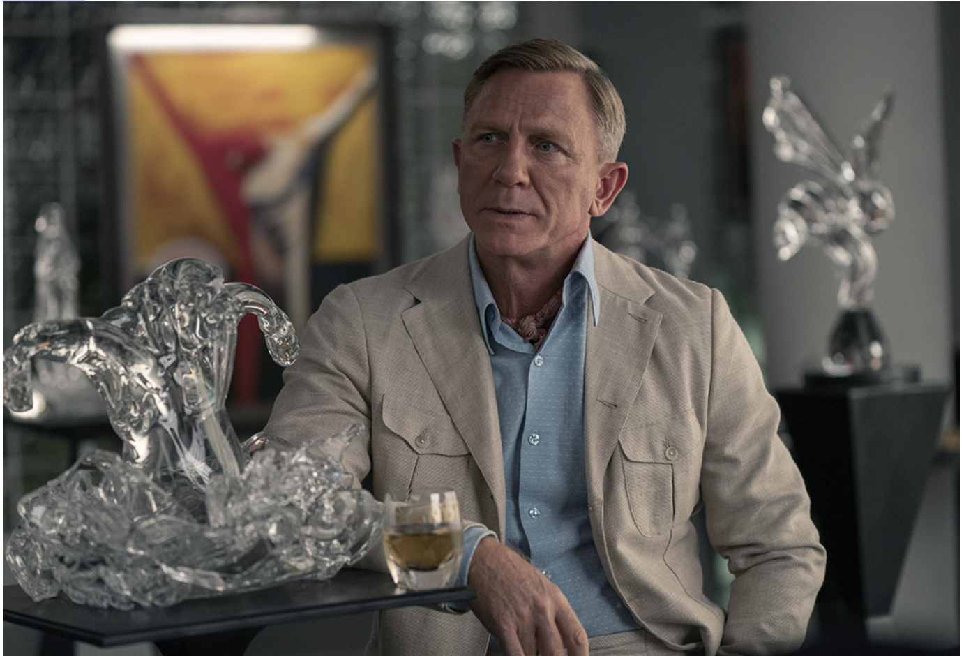
Daniel Craig as Detective Benoit Blanc in "Glass Onion: A Knives Out Mystery"