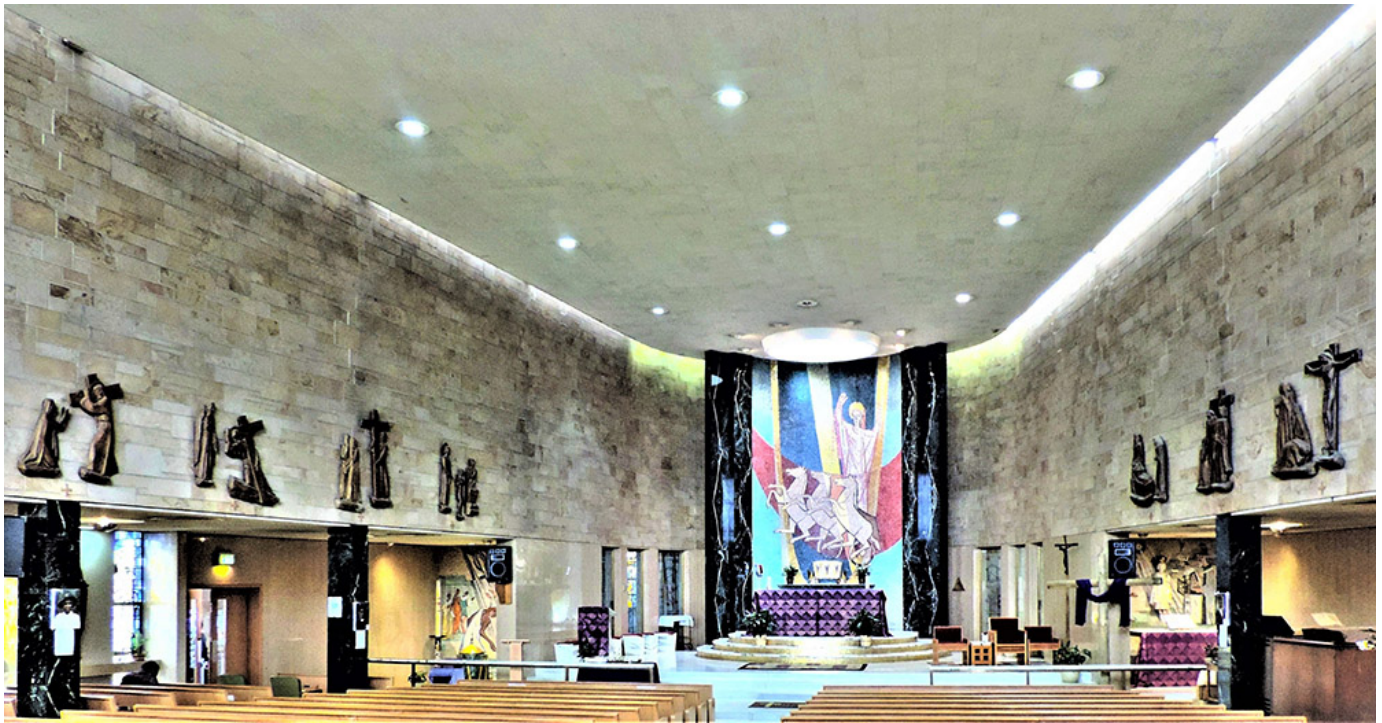
The interior of St. Rita Catholic Church in Indianapolis

According to Legg's research, some of the white priest's accomplishments at the parish and its former school include obtaining the right of Black girls to attend local Catholic high schools, instituting a tuition payment plan for financially challenged families, including roller skating lanes in the school's gym, and creating the archdiocese's first dedicated school library.