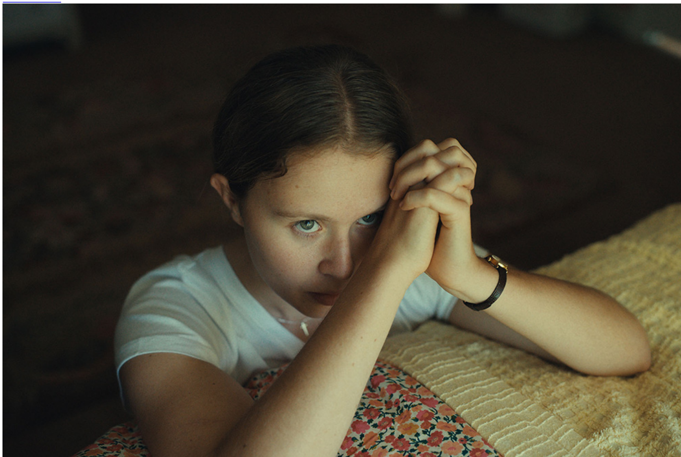
Eliza Scanlen in "The Starling Girl"