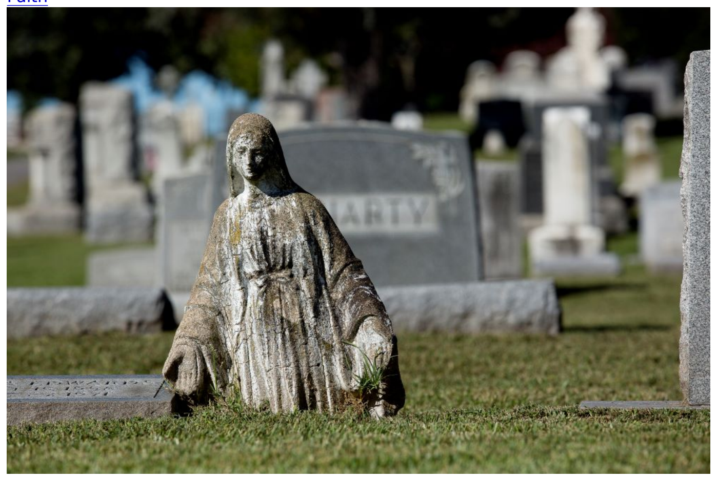
St. Mary Parish's cemetery in Alexandria, Va., is seen in this 2017 file photo.