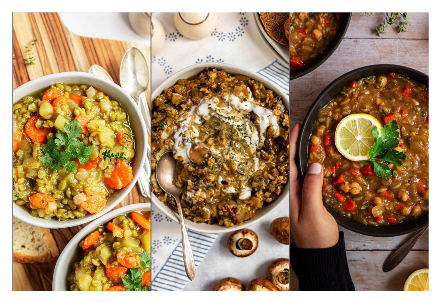
Split pea soup, mushroom wild rice soup, and vegan orzo soup (Elizabeth Varga)