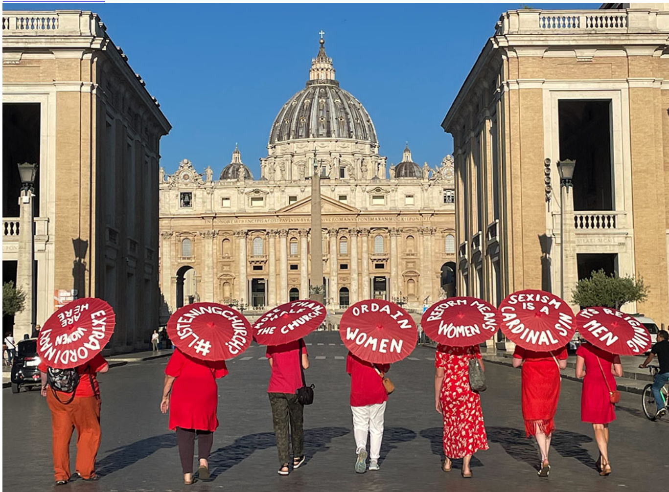
Women's ordination advocates walk toward St. Peter's Square at the Vatican as part of a witness on Aug. 29, 2022.