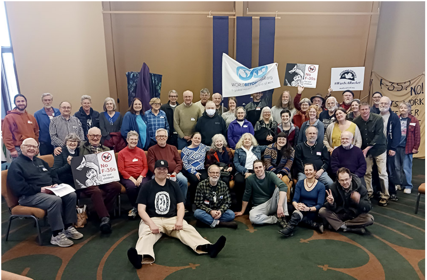
Participants in the Midwest Catholic Worker Faith and Resistance Retreat, held in Madison, Wisconsin, the last weekend in March, pose for a group photo.

We lamented the seeming generational divide that has emerged in the Catholic Worker movement over the past decade between those of us who show up to protest war and militarism (largely elders), and those who show up to combat racism and climate change (overwhelmingly youth), and wondered how we might better emphasize the intersectionality of these evils.