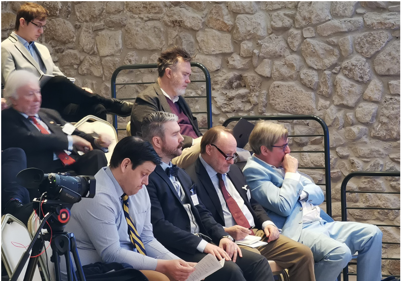
Rod Dreher, top center, attends "The Post-Liberal Turn and the Future of British Conservatism," a one-day conference held at the Danube Institute in Budapest, Hungary.

Despite these newfound pacifist tendencies, however, Dreher is still at war.