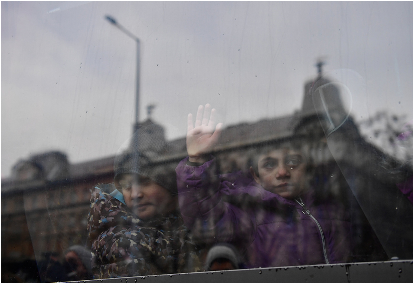
Children of refugees fleeing from Russia's invasion of Ukraine wait for transport at Nyugati railway station Feb. 28, 2022, in Budapest, Hungary.

Such an idea, of course, is anathema to the rest of Europe — including politically conservative Poland, which shares a 330-mile border with Ukraine — which sees Russia as both a physical and existential threat to liberal democracy. It also denies self-determination to Ukraine, which, incidentally, is the case Hungary likes to make about its own sovereignty as a nation.