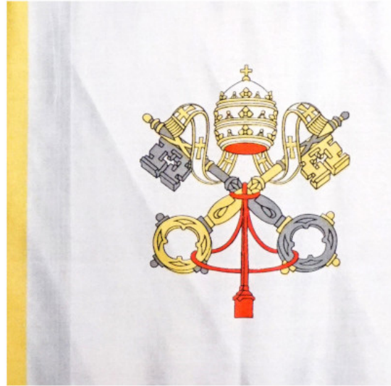
Vatican City flag at a souvenir shop