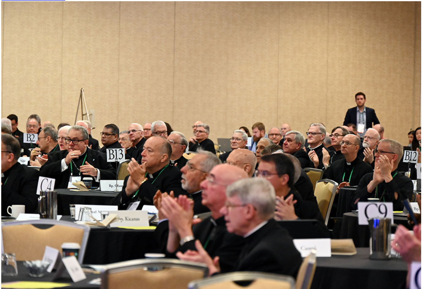
Bishops applaud during the U.S. Conference of Catholic Bishops meeting June 15 in Orlando, Florida.