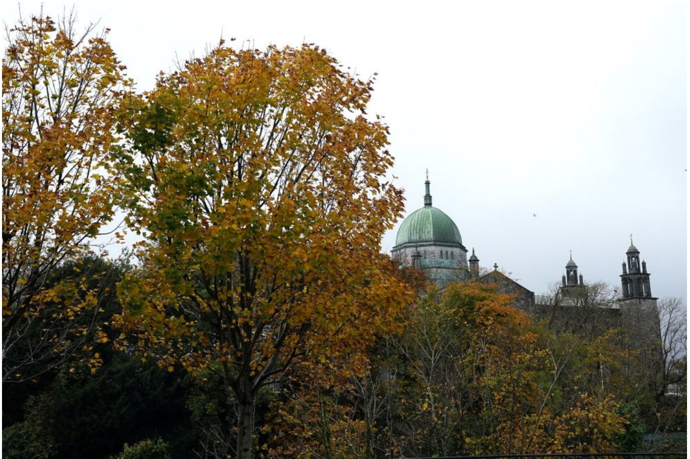
Autumn colors frame the Cathedral of Our Lady Assumed into Heaven and St. Nicholas, commonly known as the Galway Cathedral, in Ireland Oct. 20, 2020.