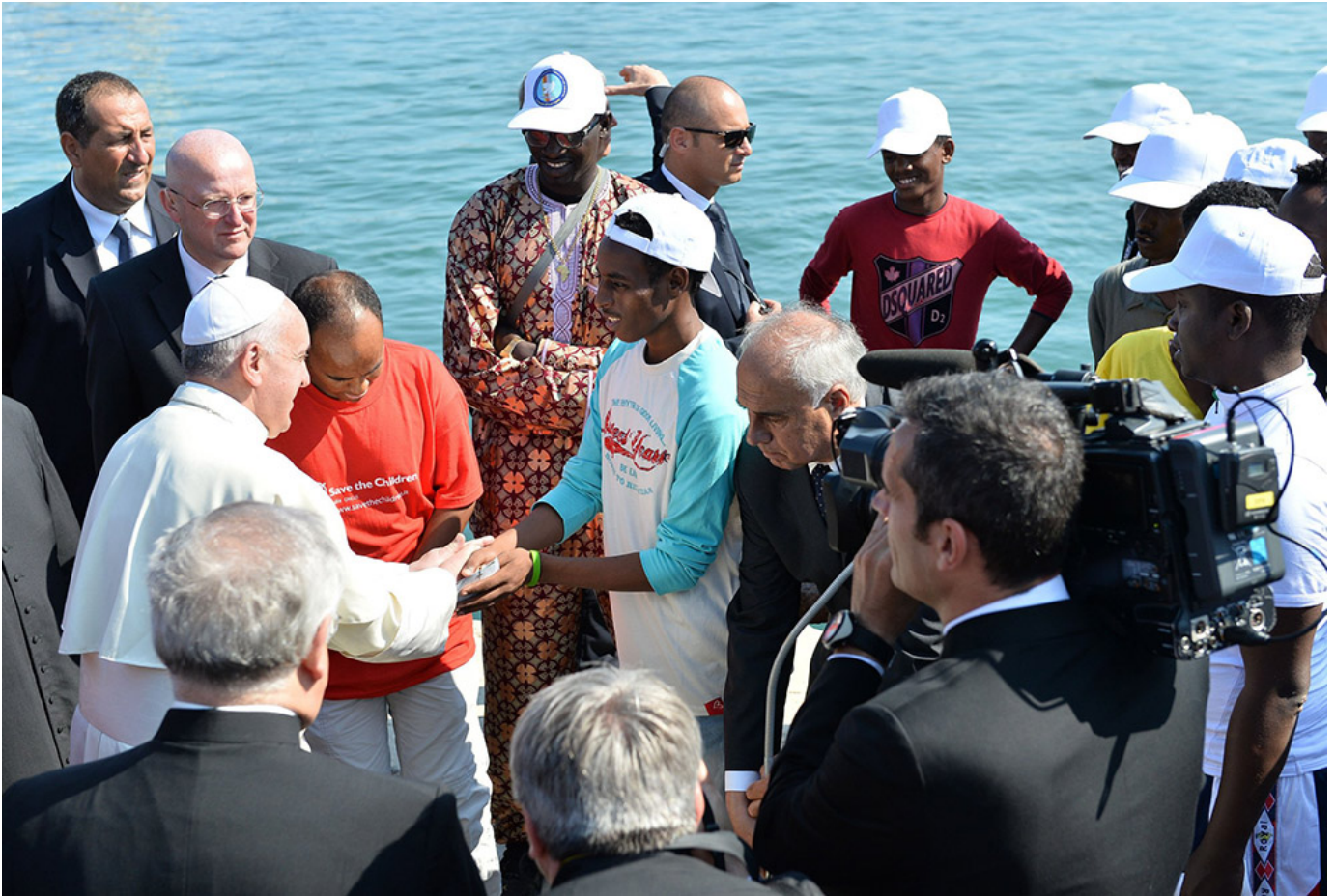
Pope Francis greets immigrants as he arrives at the port in Lampedusa, Italy, July 8, 2013.