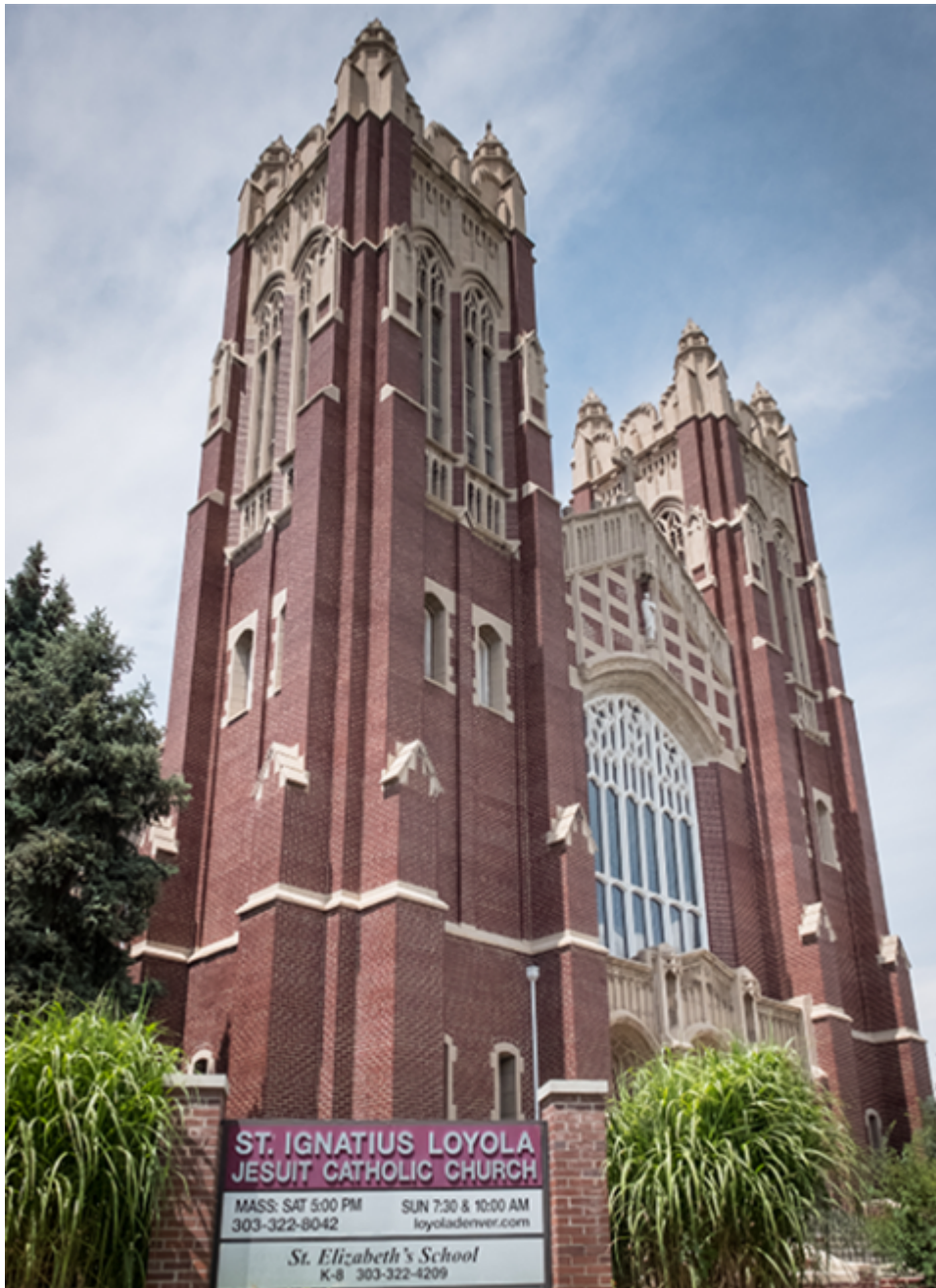
The exterior of St. Ignatius of Loyola Parish in Denver

"This is not an action I take lightly. This decision comes only after many years of discernment and conversations," wrote Greene.