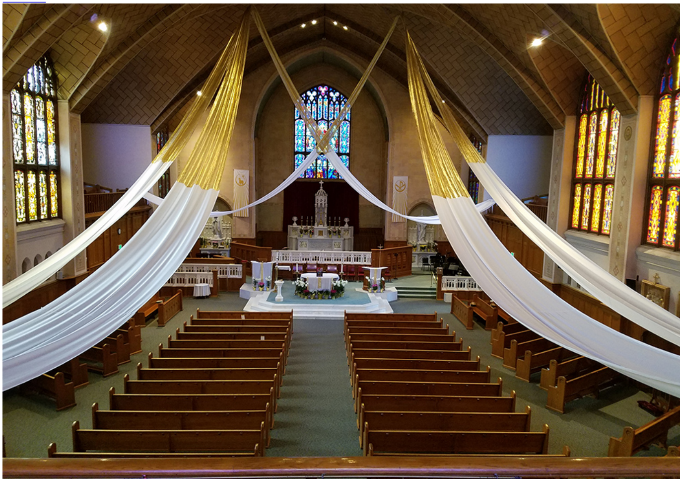
St. Ignatius of Loyola Parish's sanctuary, decorated for Easter