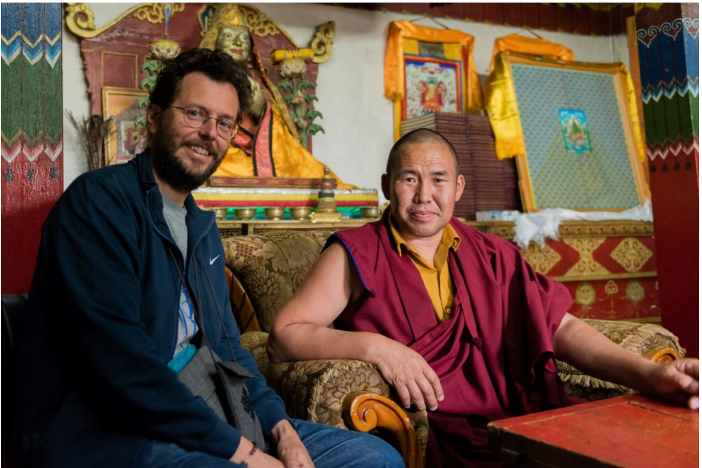
Cardinal Giorgio Marengo, apostolic prefect of Ulaanbaatar, Mongolia, is pictured with a Buddhist leader in July 13, 2018, file photo. More than half the Mongolian