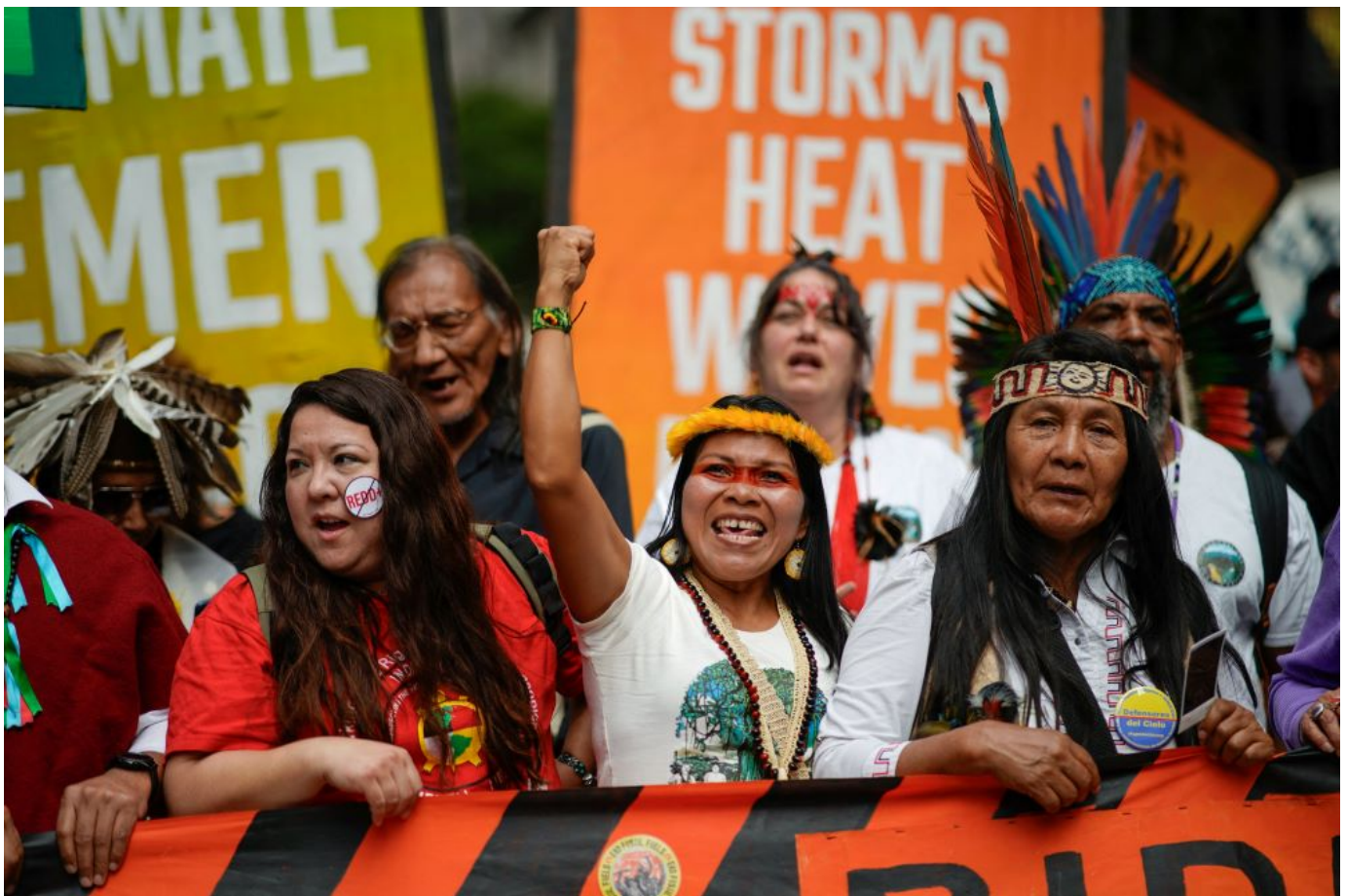
An Indigenous woman gestures as activists mark the start of Climate Week in New York City Sept. 17, 2023, during a demonstration calling for the U.S. government to

Marchers also called upon Biden to halt fossil fuel expansion and extraction, including the Willow Project in the Arctic, leases in the Gulf of Mexico and the Mountain Valley Pipeline in Virginia and West Virginia.