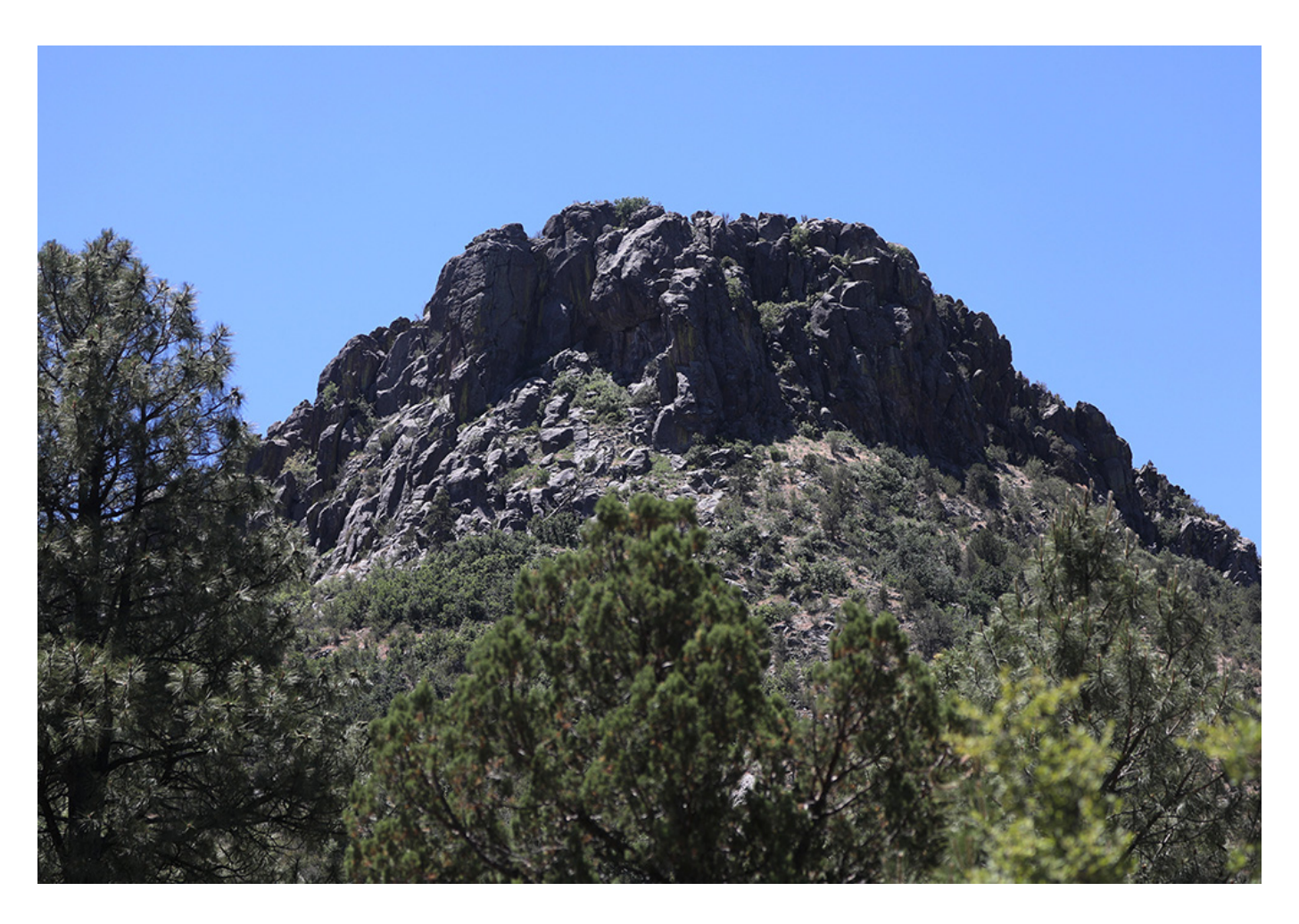
Thumb Butte is seen in Arizona's Prescott National Forest on June 24.

You thought it was important for Catholics, and others, in Tucson to know that the U.S. bishops' conference <u>supported the EPA proposal</u> to put stricter limits on carbon pollution from power plants. For places with bishops who might not be so willing to write op-eds advocating for support of climate policy, how best can concerned Catholics spread the word that this is an issue of importance to the church?