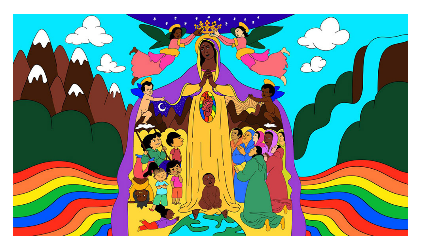
"Madonna's Earth" original vector illustration by Haitian American artist Raphaella Brice

The response in Vermont has been broad and positive. Raphaella has been featured by the local papers <u>Burlington Free Press</u> and <u>Seven Days</u>. Her work was on the cover of the summer issue of the <u>Vermont Catholic</u>. And a new Black Madonna mural went up in Waterbury, a town in central Vermont, one of the communities affected by the <u>July 2023 flooding</u>.