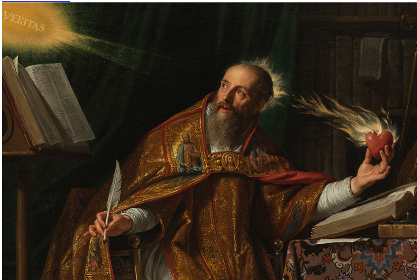
"Saint Augustine" (circa 1645), by Philippe de Champaigne