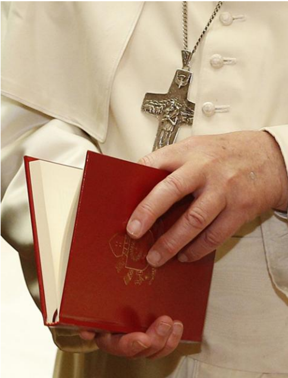
Pope Francis holds a copy of his exhortation Evangelii Gaudium in 2014.