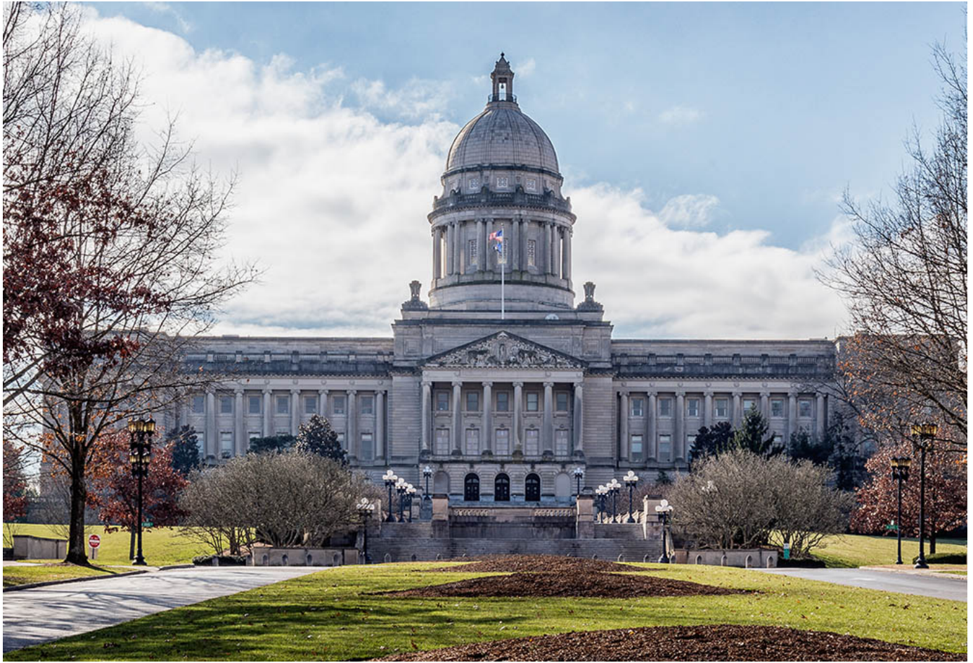
The Kentucky State Capitol building in Frankfort, Kentucky (Wikimedia Commons/Mobilus In Mobili)