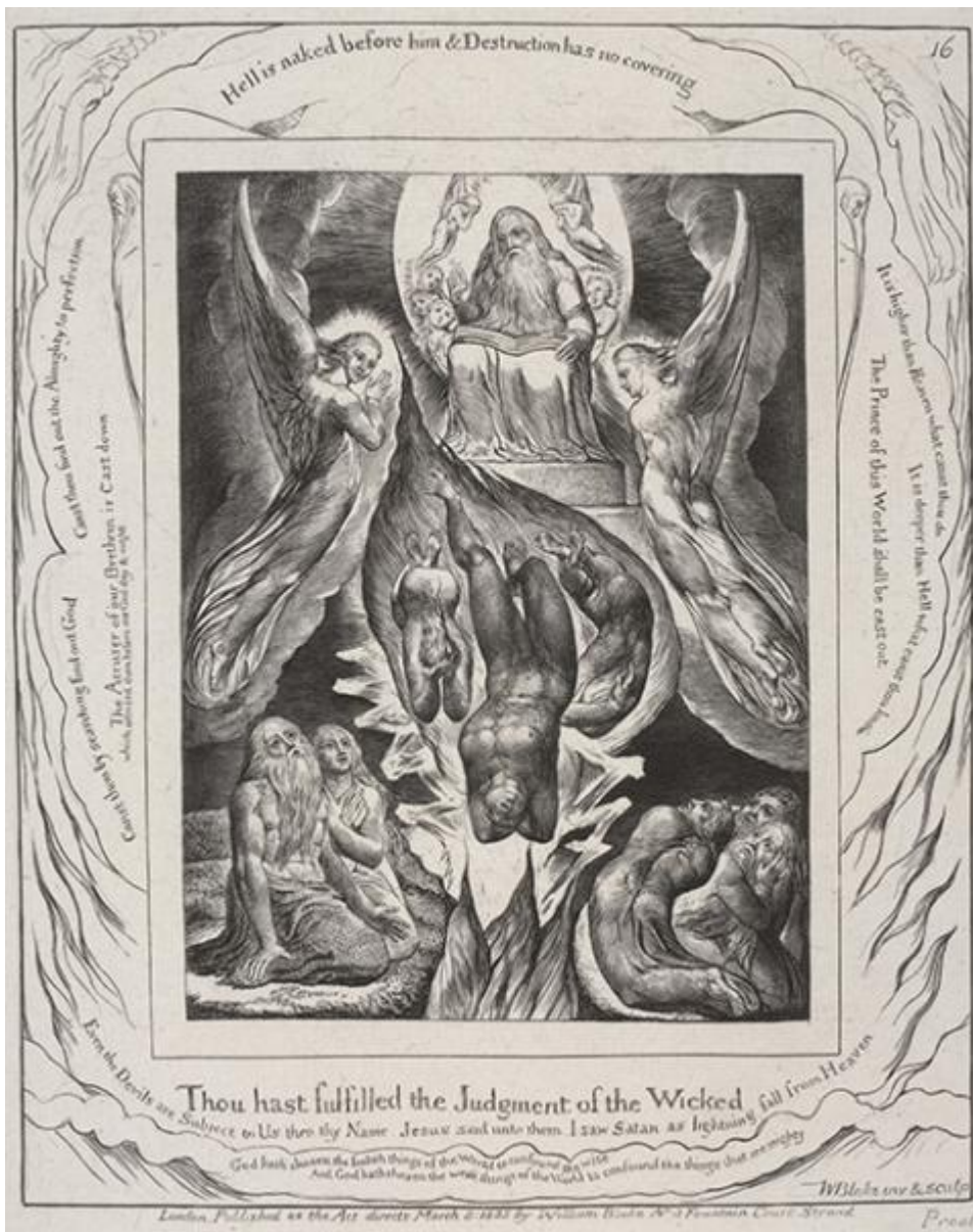
Plate 16 from "Illustrations of the Book of Job," printed 1825, William Blake (British, 1757-1827), engraving

To many, Blake was a forerunner of counterculturalism.