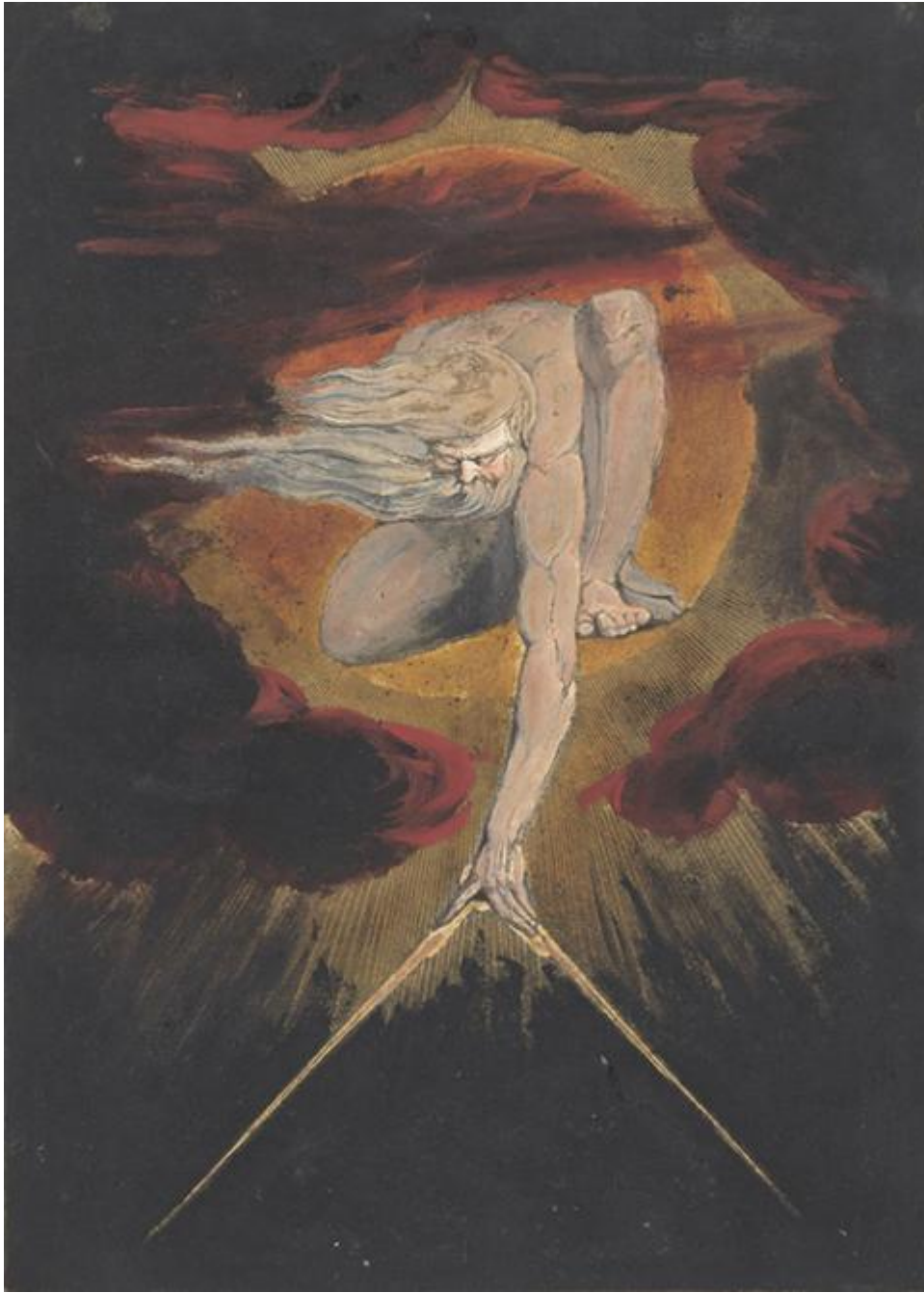
"The Ancient of Days," from "Europe a Prophecy," printed 1795, William Blake (British, 1757-1827), color-printed relief etching in dark brown with pen and black ink, oil, and watercolor

It was worth the wait. I've seen some of the works before, including at the Tate, but it was inspiring to see so many Blake works exhibited together.