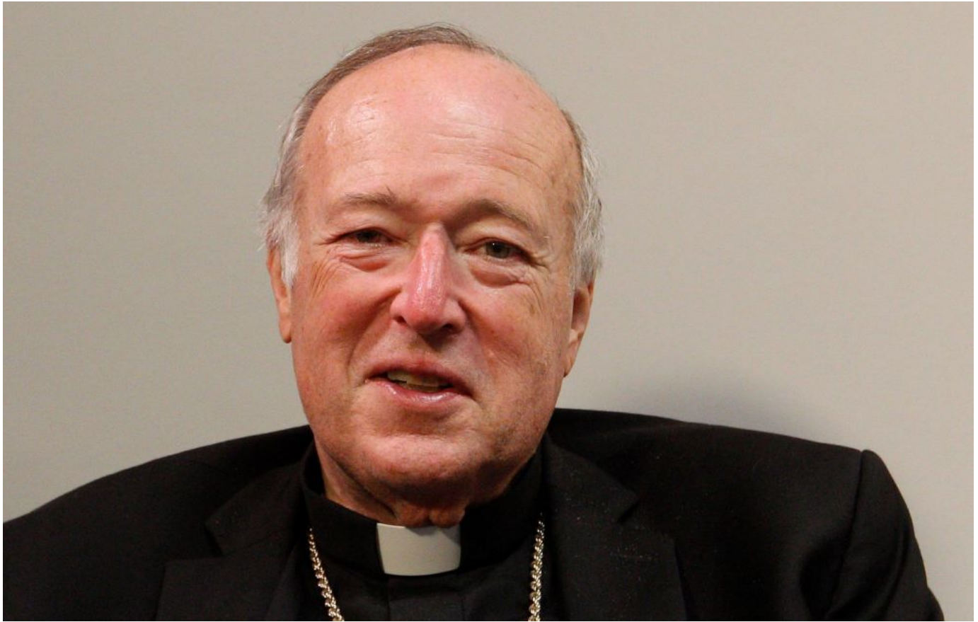
Cardinal Robert McElroy of San Diego is pictured at the Vatican press hall in this Aug. 27, 2022, file photo.

For us as men and women of the 21st century, this very same estrangement reverberates through our relationship with the earth that is our common home. Perceiving in the recesses of our soul the magnificence of the world that God has created for the entire human family, we yet allow selfishness, denial, the thirst for control, radical individualism and the rejection of God to forge a culture that progressively destroys the beauty and sustainability of the world which is our common home. And in that contradiction, we are estranged from the created order which God bestowed upon the human family as the setting of our pilgrimage on this earth.