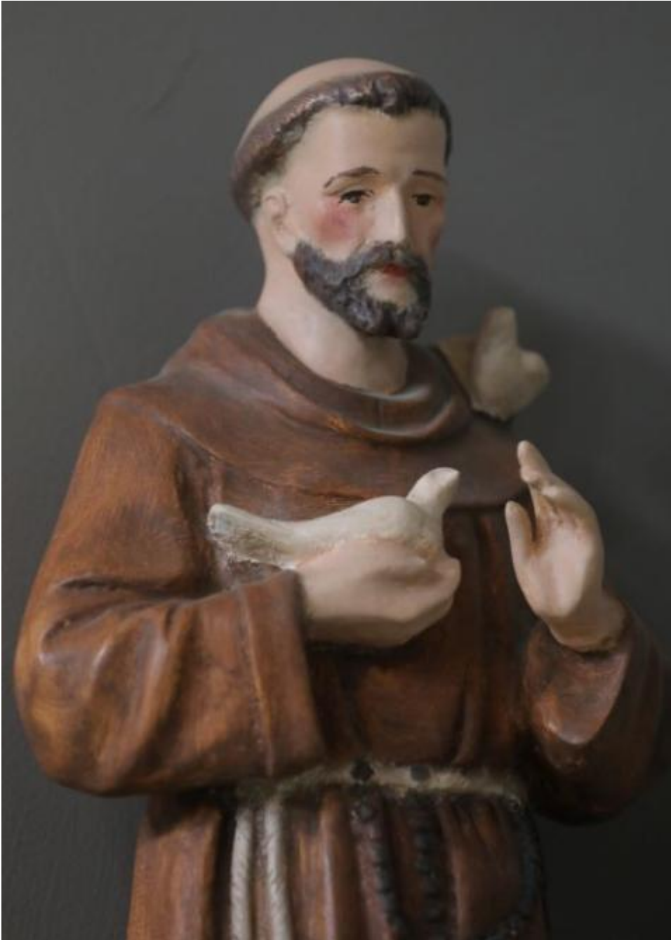
A statue of St. Francis of Assisi is displayed inside Jesus the Divine Word Church in Huntingtown, Maryland, Aug. 20, 2021.

Central to the identity of any Catholic university is the desire to bring students into explicit encounter with God. Our universities find many effective ways to meet this desire: the celebration of the sacraments, courses on the Catholic tradition and religious studies, retreats, sacred spaces, spiritual guidance, the culture of the university itself.