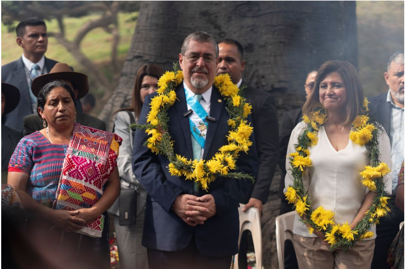
Guatemalan President Bernardo Arévalo, center, and Vice President Karin Herrera, right, attend an Indigenous ceremony held in their honor at the sacred Mayan site Kaminaljuyu in Guatemala City, Jan. 16, a day after they were inaugurated. Arévalo was elected in a landslide in August.