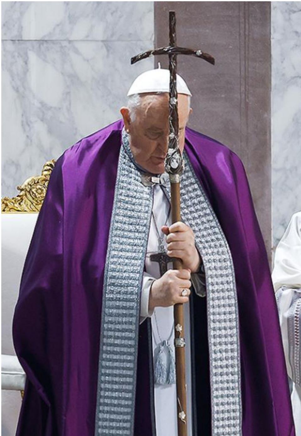
Pope Francis holds his crosier as the Gospel is read during his Ash Wednesday Mass at the Basilica of Santa Sabina in Rome Feb. 14.

The world tells us exactly the opposite: entertainment, pleasure, diversion and escape make for the good life. The worldly person ignores problems of sickness or sorrow in the family or all around him; he averts his gaze. The world has no desire to mourn; it would rather disregard painful situations,