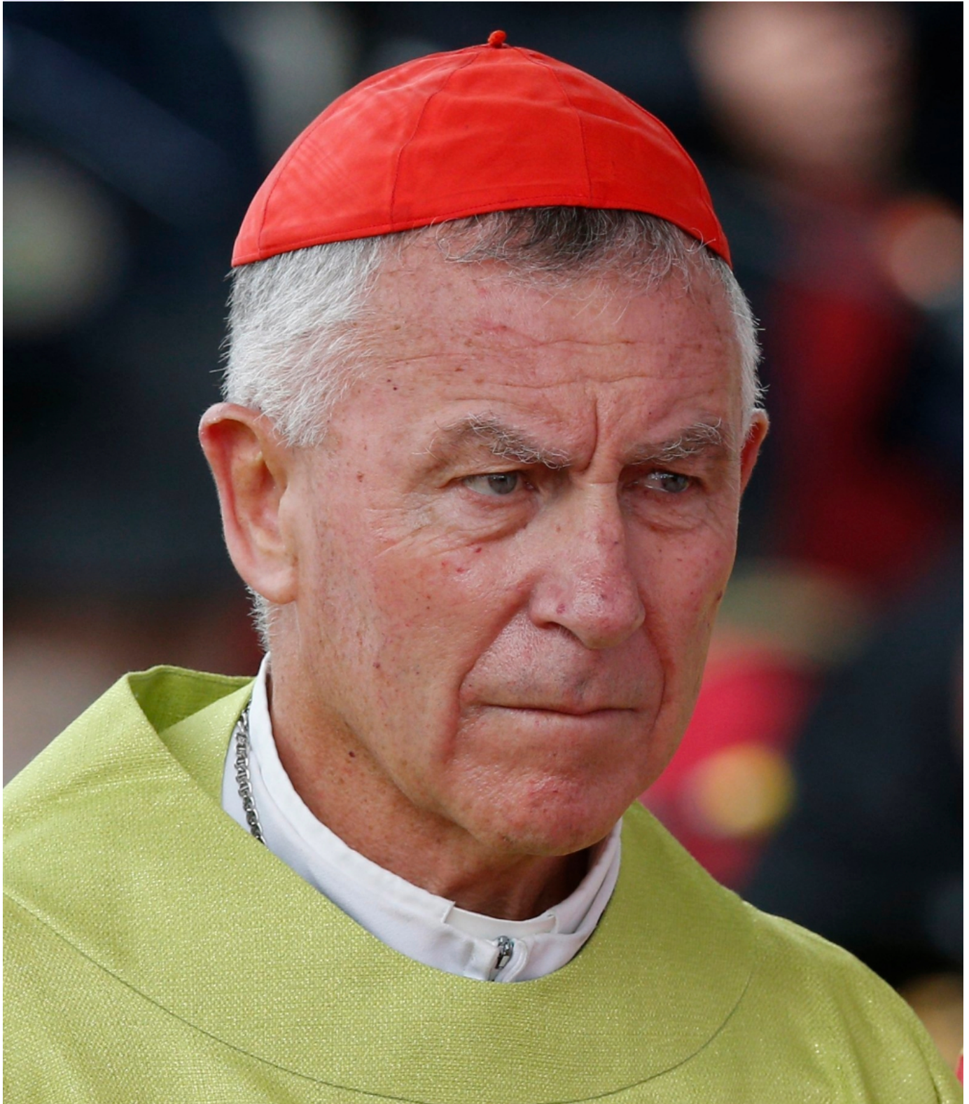
New Zealand Cardinal John Dew, retired archbishop of Wellington, is pictured in a 2018 photo. Following "Vox Estis Lux Mundi" protocol, the Wellington Archdiocese said March 7, 2024, it has opened a church inquiry into a claim of abuse against the