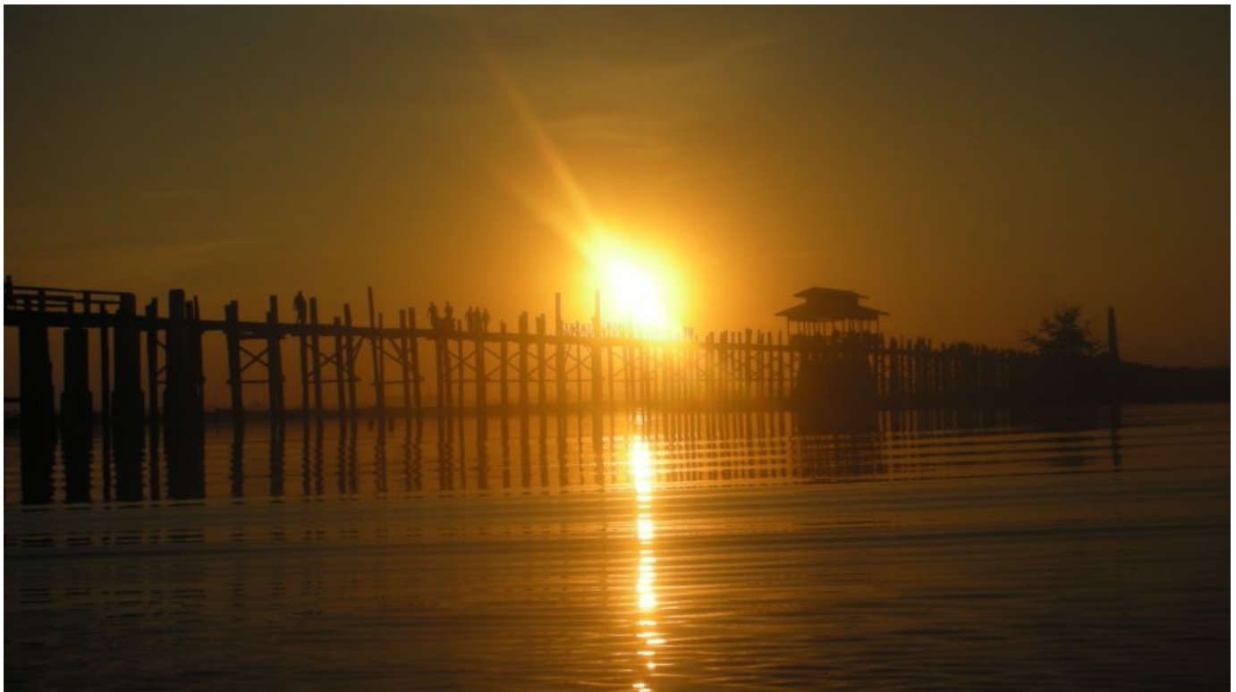
The U Bein Bridge in Mandalay, Myanmar, spans about 1,300 yards across Taungthaman Lake and is a popular tourist site.