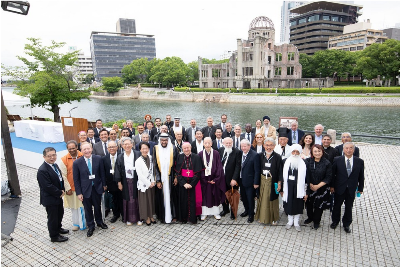
Participants of a conference on AI ethics, including several representatives of world religions, pose for a photo in Hiroshima, Japan, July 10, 2024. Standing front and center is Archbishop Vincenzo Paglia, president of the Pontifical Academy for Life.