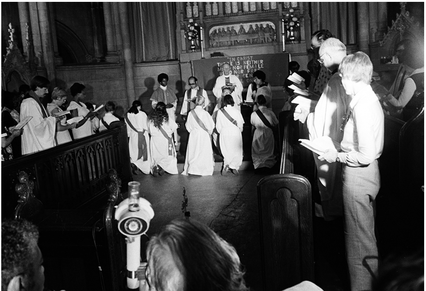
Jeannette Piccard kneels in the center, third from right, during the ordination service at Church of the Advocate, July 29, 1974, in Philadelphia. Piccard was ordained to

In her autobiographical notes held at the Library of Congress, Jeannette wrote, "With virtue drip[ping] from their lips," the society "would have nothing to do with sending a woman and a mother on so dangerous an expedition!" About her decision to pilot the balloon, she added , "When one is a mother ... one does not risk life for a mere whim. One must back up emotions by cold reason. One must have a cause worthy of the danger. In times of war one sacrifices self and children for country. In times of peace the sacrifice is made for humanity."