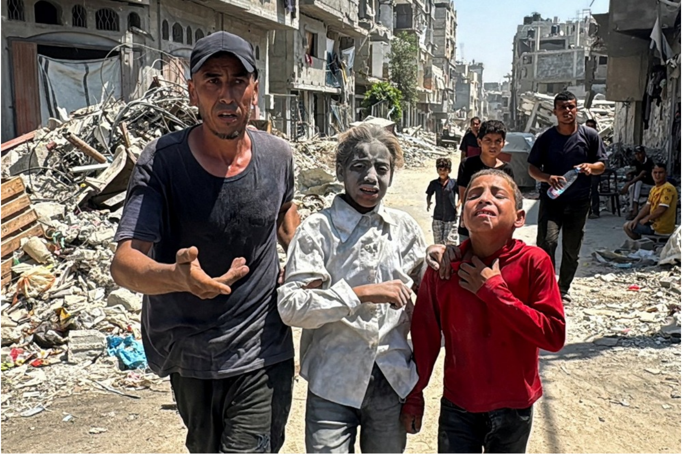
Palestinians react at the site of an Israeli airstrike that destroyed several houses, amid Israel-Hamas conflict, in Khan Younis in the southern Gaza Strip Aug. 27, 2024.