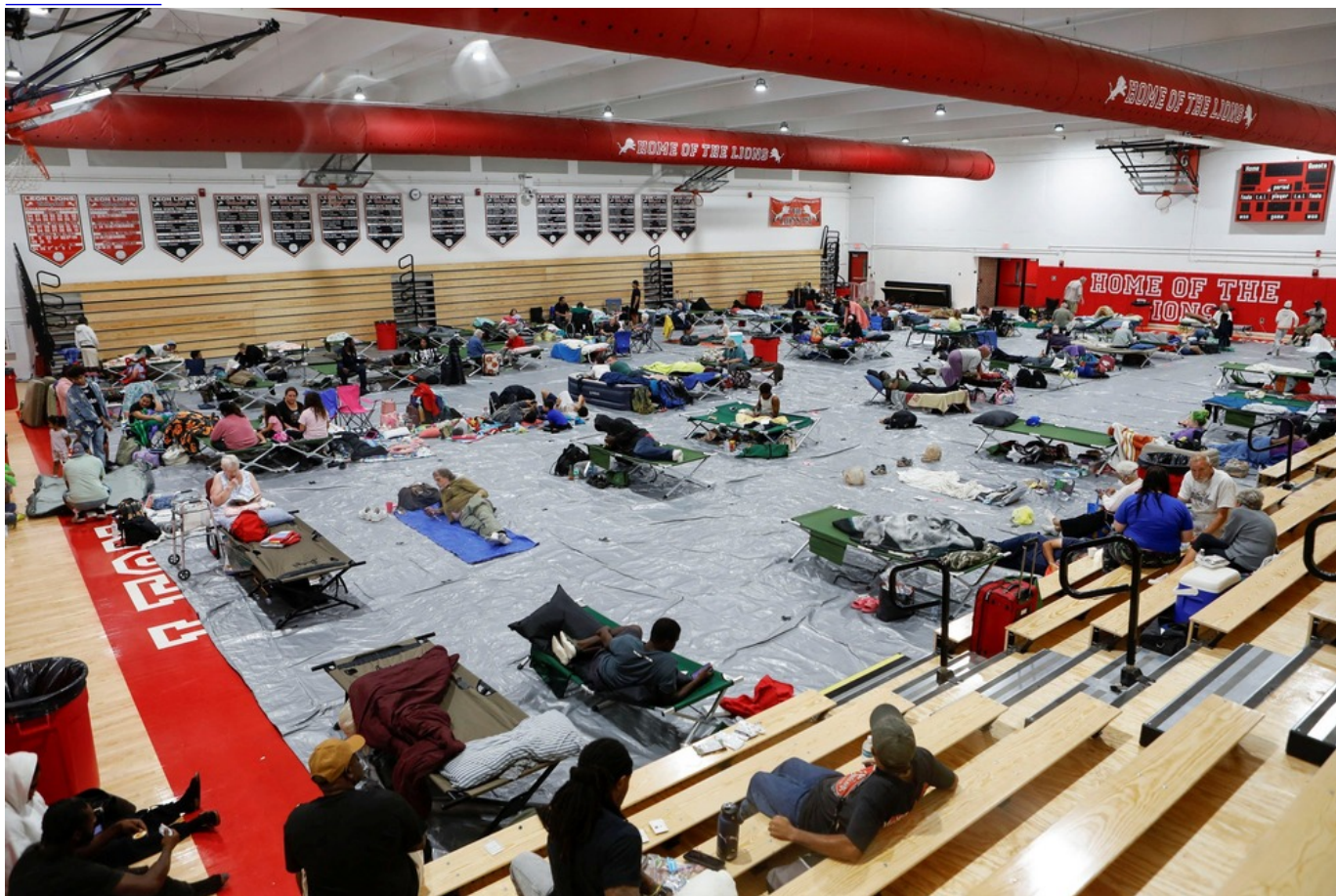
Displaced residents take shelter from Hurricane Helene at Leon High School near downtown Tallahassee, Fla., Sept. 26, 2024.