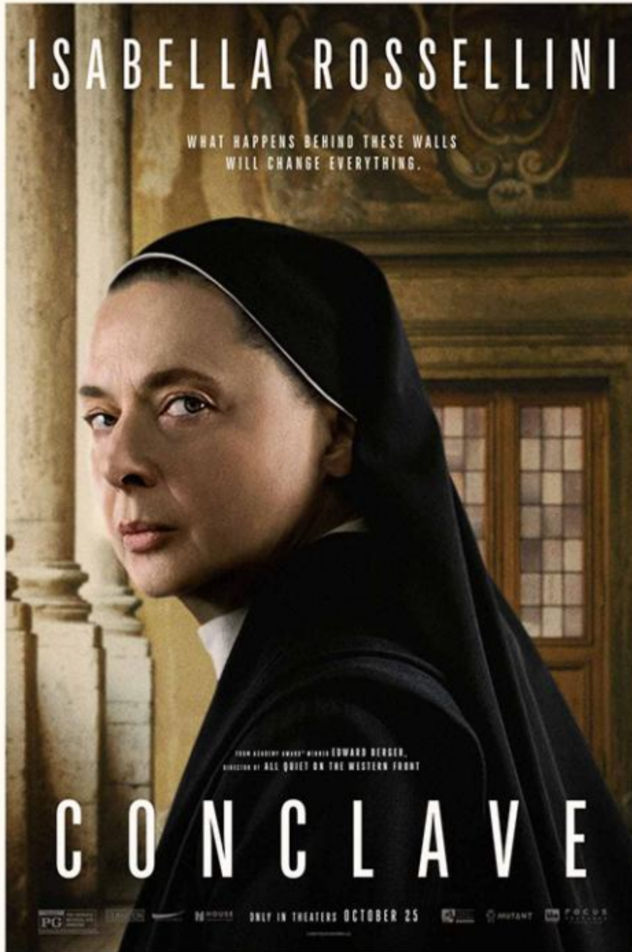
Isabella Rossellini in "Conclave" (Focus Features)

Rossellini : I loved Lawrence's speech about doubt. Whether it's society or the church, we forget that we're humans, prone to make mistakes due to our limited understanding. The film reminds you of that. I like that the film ends with a big question mark in many ways. The pope that is selected is not the one people expected, but he is the one who has dedicated his life to the poor and needy.