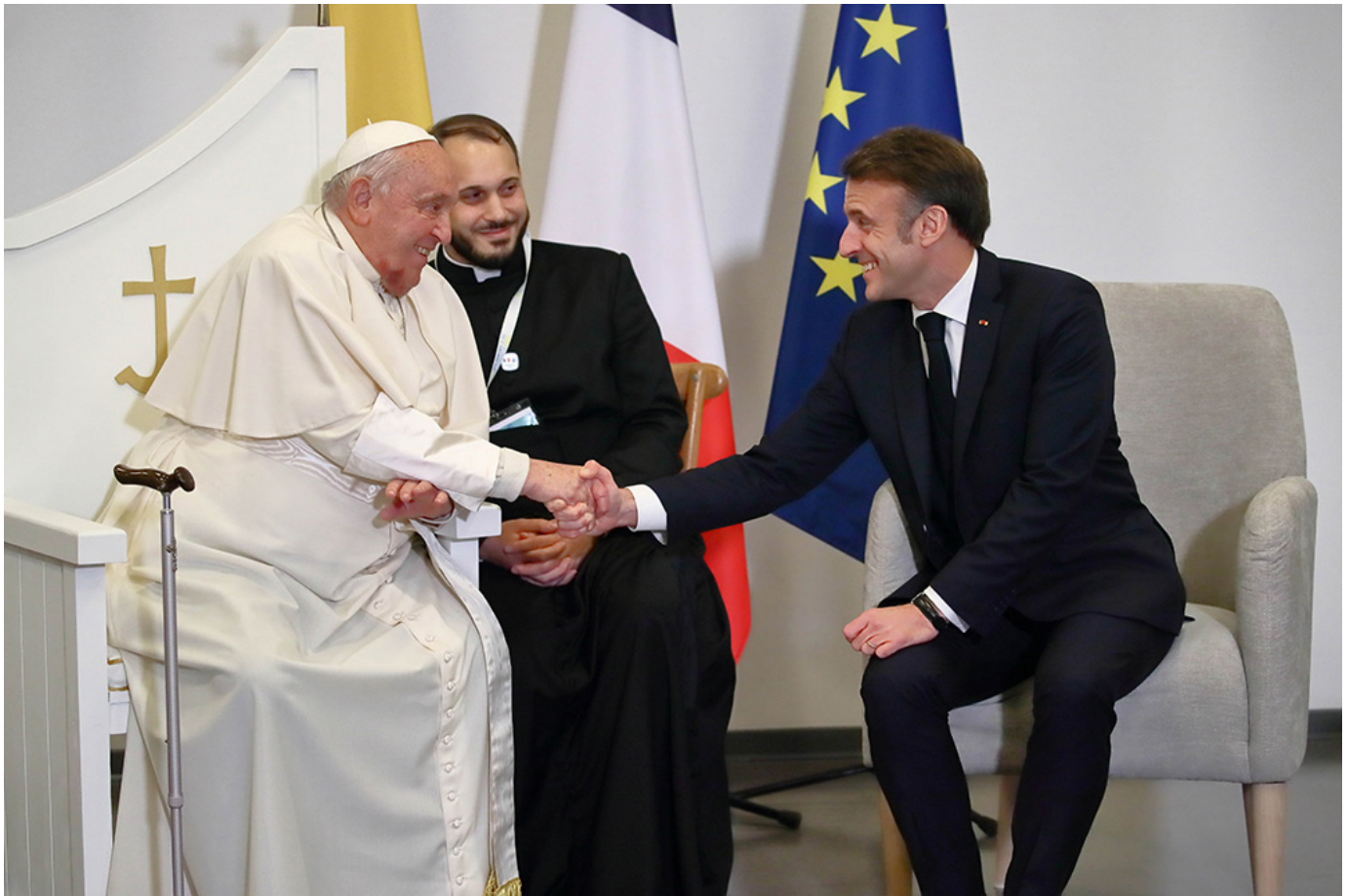
Pope Francis meets with French President Emmanuel Macron at Ajaccio Napoleon Bonaparte Airport during his one-day visit to Ajaccio, France, Dec. 15, 2024.

In France, palliative care is currently accessible to only half the patients who need it, due to a lack of competent staff and adequate hospital structures. The nursing staff concerned had expressed fears that the adoption of a law on "active assistance in dying" would jeopardize their funding.