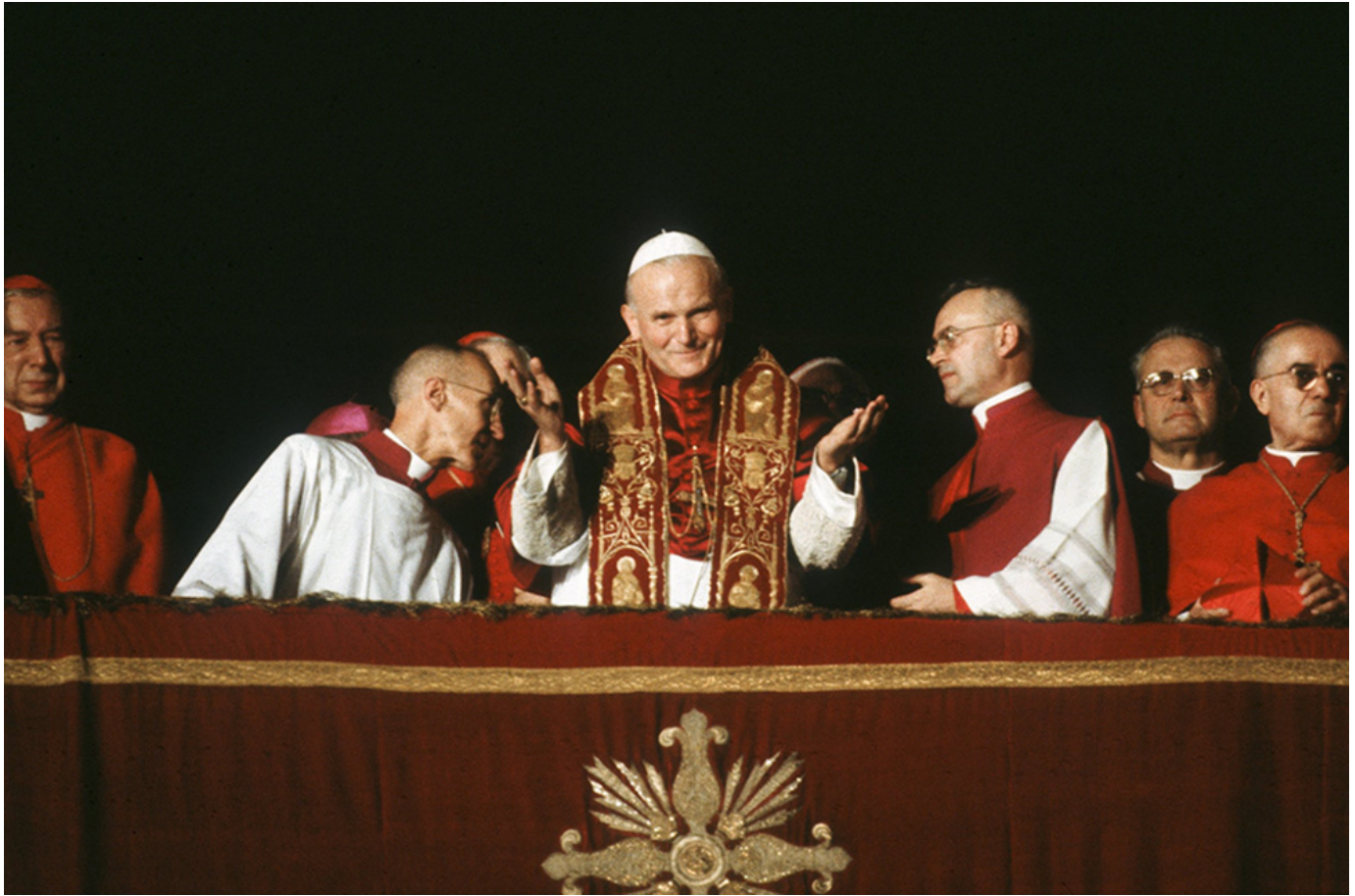
Pope John Paul II appears on the balcony at St. Peter's Basilica following his election to head the Catholic Church on Oct. 16, 1978.