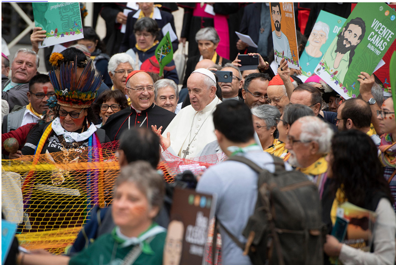
Pope Francis is pictured with Cardinal Pedro Barreto Jimeno of Huancayo, Peru, during a procession at the start of the first session of the Synod of Bishops for the Amazon at the Vatican Oct. 7, 2019.