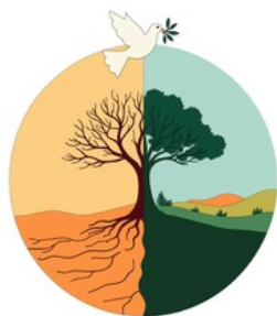
Garden of Peace Isaiah 32:14-18