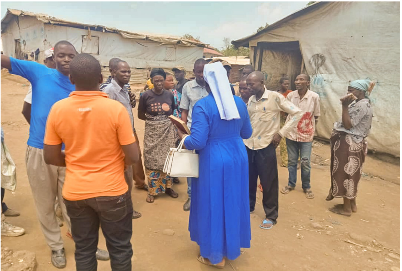
A sister visits displaced individuals, including women and girls, in a camp in the eastern town of Goma, Democratic Republic of Congo.

To document the unfolding diaspora and the horrors of the decadelong war, NCR's Global Sisters Report went to Central Africa and interviewed victims and their families — and the Catholic sisters who work to care for the people trapped in the continuing warfare.