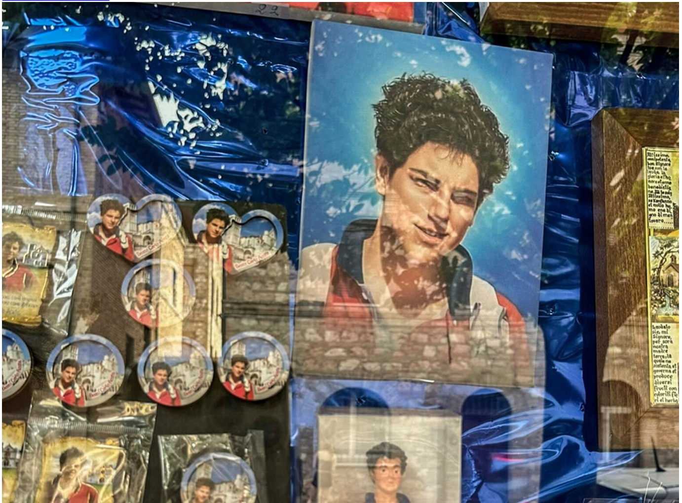
Carlo Acutis souvenirs are displayed in a shop window in Assisi, Italy, in June 2023.