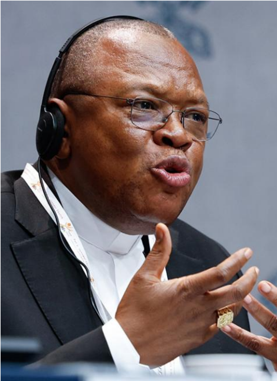
Cardinal Fridolin Ambongo Besungu