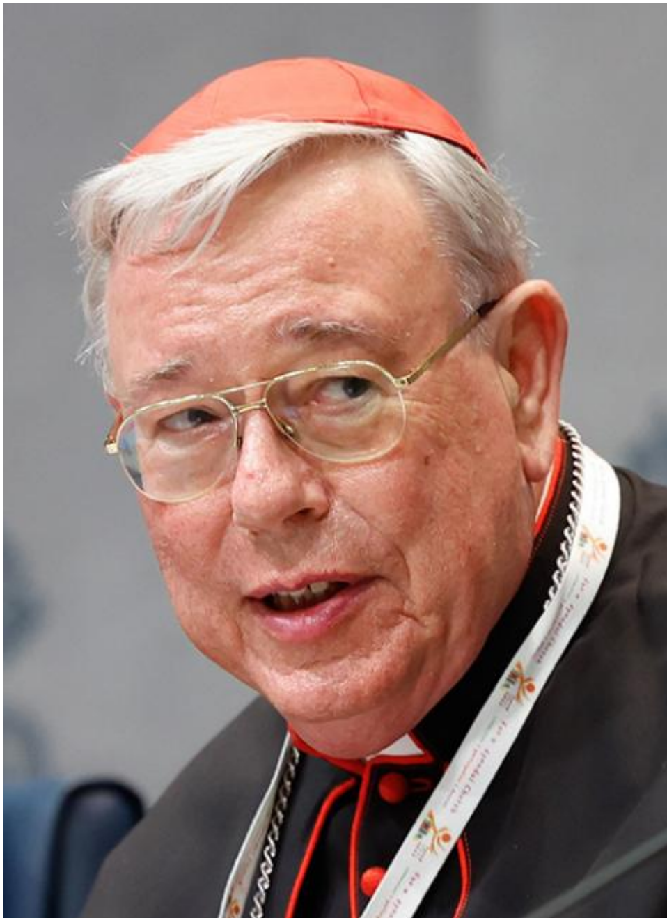
Cardinal Jean-Claude Hollerich