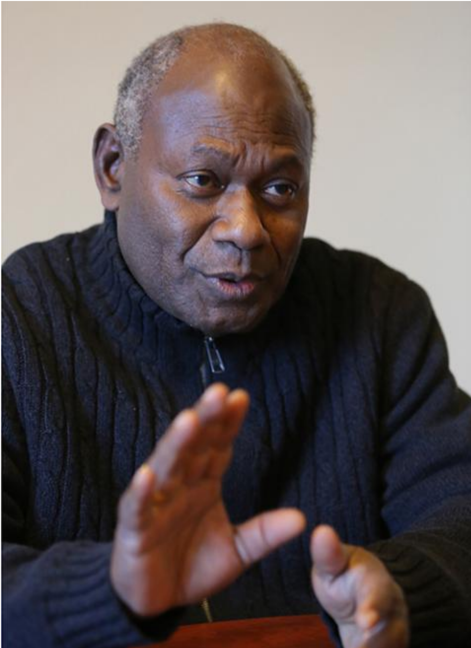
Cardinal John Ribat