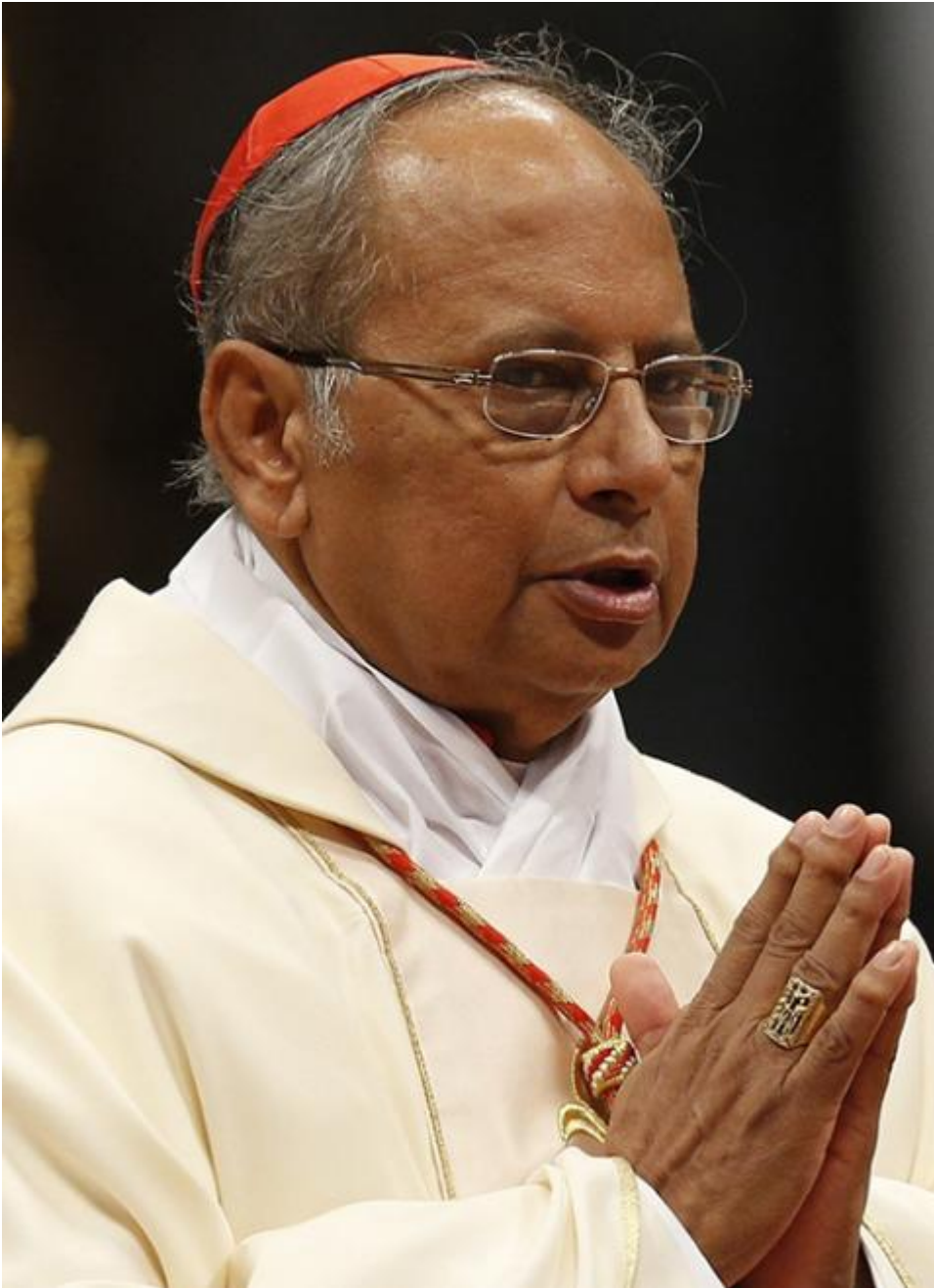
Cardinal Malcolm Ranjith