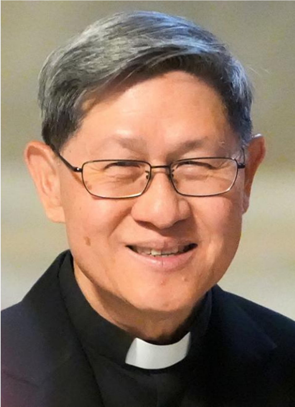
Cardinal Luis Antonio Tagle

Below is a (non-exhaustive) review of some of the leading cardinals at the intersection of faith, ecology and climate.