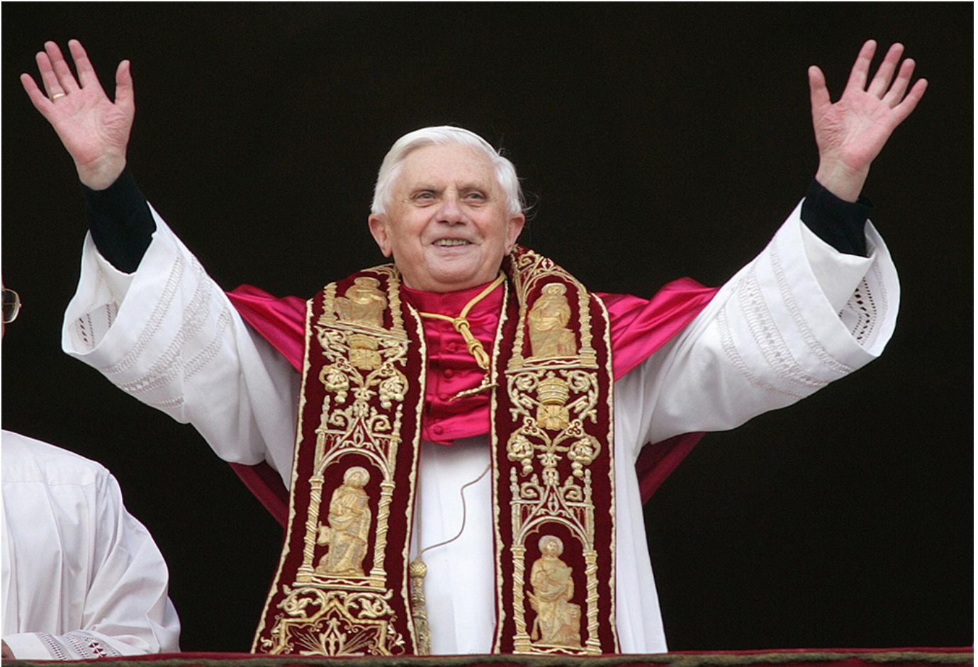
Pope Benedict XVI greets the world from St. Peter's Basilica after his election April 29, 2005.