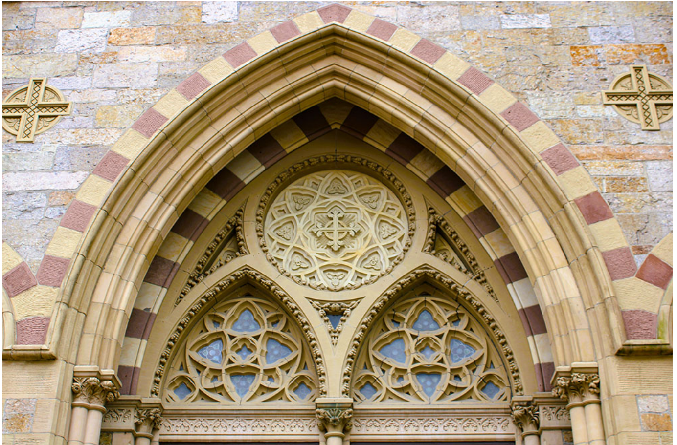
The tympanum above the central entrance to the Cathedral of the Holy Cross in Boston