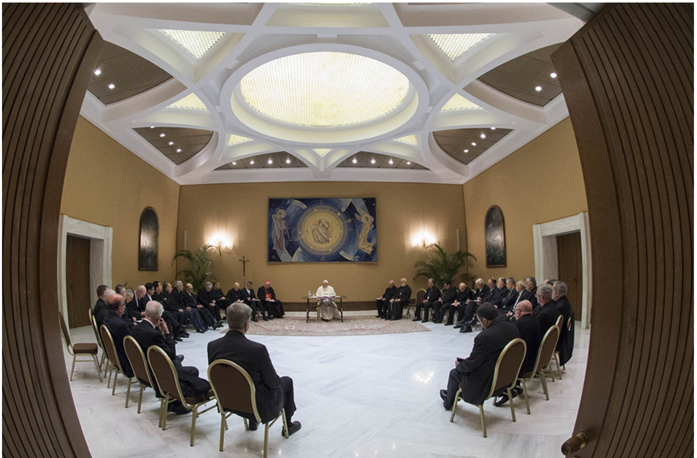
Pope Francis and 34 Chilean bishops are pictured meeting at the Vatican May 15, 2018, to discuss the clerical sexual abuse crisis in Chile.