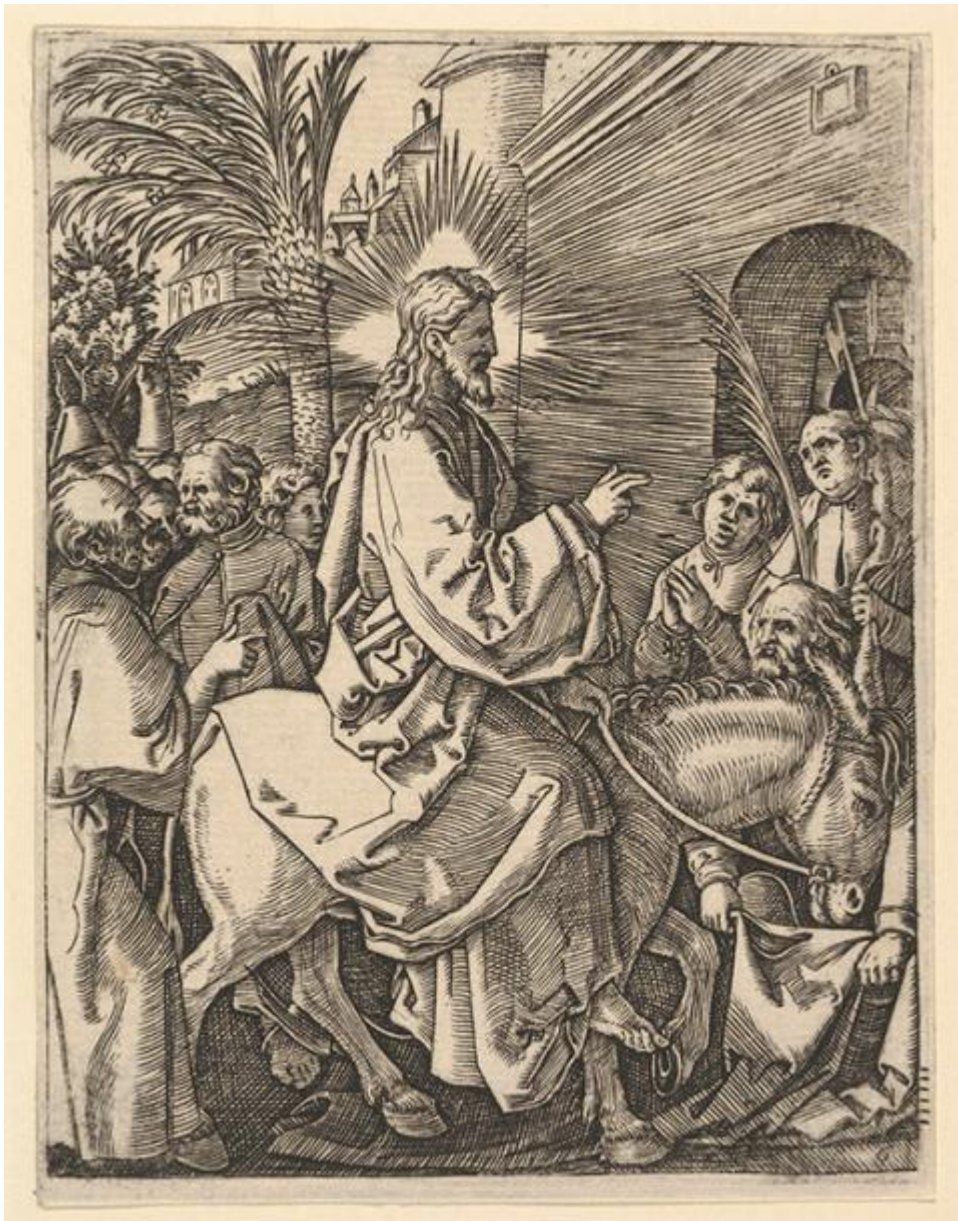
"The Entry into Jerusalem; Christ riding on a donkey towards an arched city gate; an elderly man spreads out his cloak on the road," from "The Passion of Christ", after Albrecht Dürer, circa 1500-34, by Marcantonio Raimondi (Metropolitan Museum of Art)

Empire has always had its gatekeepers — its preachers and pundits — willing to look the other way, willing to serve comfort over truth, to maintain order rather than pursue justice. But true peace cannot come from pretending all is well while the oppressed suffer beneath the burden of exploitation. True peace cannot come from spectacle or tanks or weapons disguised as salvation.