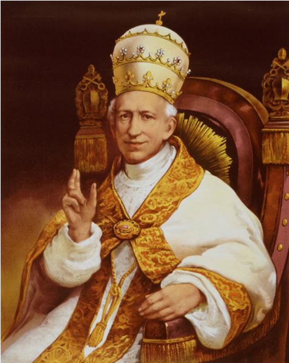
Pope Leo XIII is depicted in this official Vatican portrait.