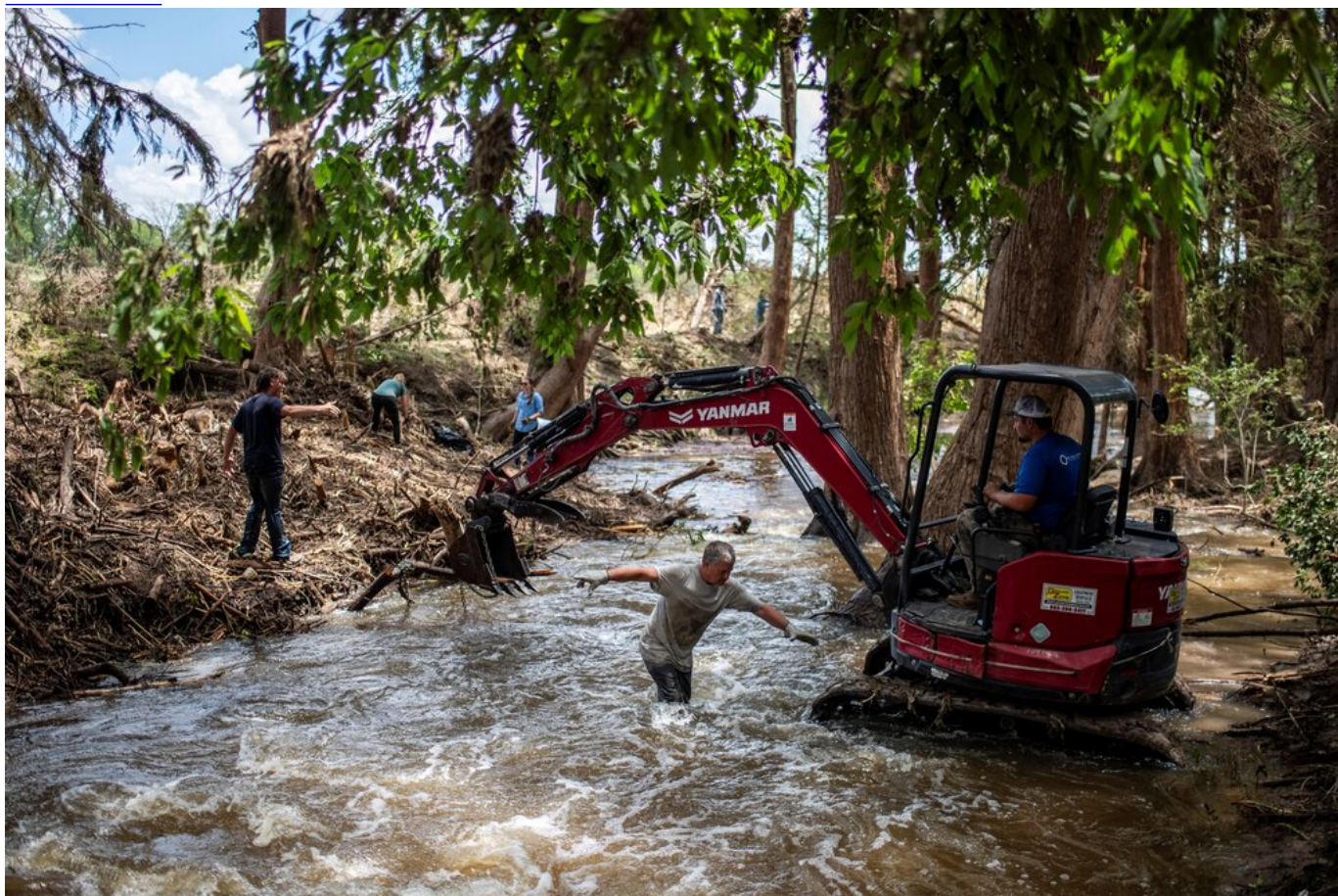
A person uses machinery to clear debris along the banks of the Guadalupe River after catastrophic floods in Center Point, Texas, July 11, 2025.