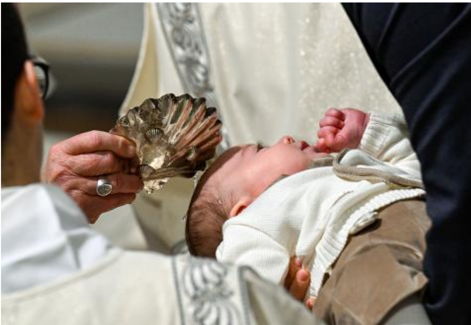
Pope Francis baptizes a baby during Mass in the Sistine Chapel at the Vatican Jan. 12, 2025, the feast of the Baptism of the Lord.

Jesus offers a different option: become rich in what matters to God. That's a wonderful, philosophical and pious answer. But what does it mean in real life? Almost equally philosophically, Paul tells us to "seek what is above," because we have "died, and [our] life is hidden with Christ in God."