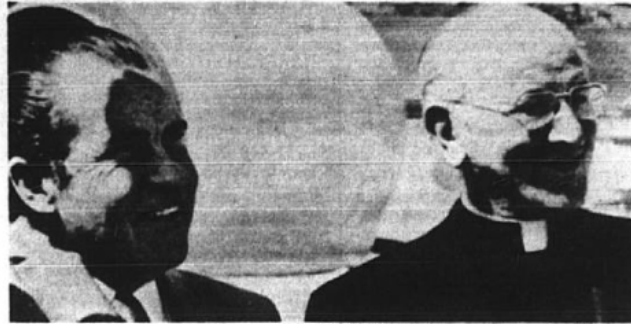
NIXON AND KROL: Three visits so far this year.

ance, in the midst of an impassioned battle to repeal New York's liberal abortion law, Nixon wrote a highly publicized letter to New York City's Cardinal Terence Cooke,